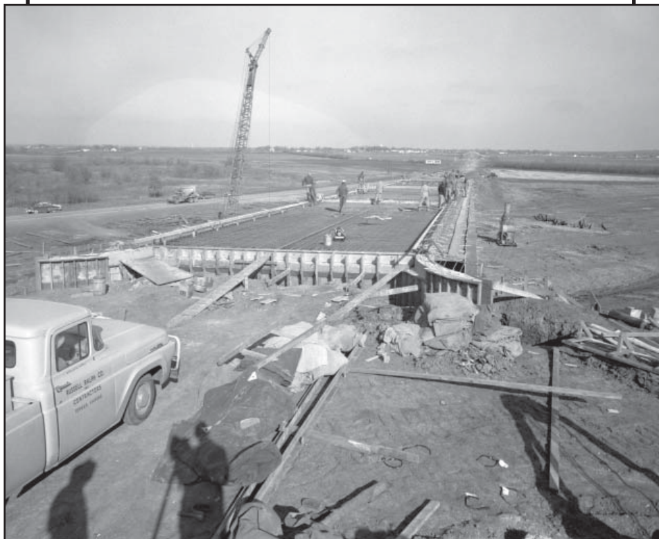
Workers construct a bridge on I-70 west of Topeka in Shawnee County in 1959.