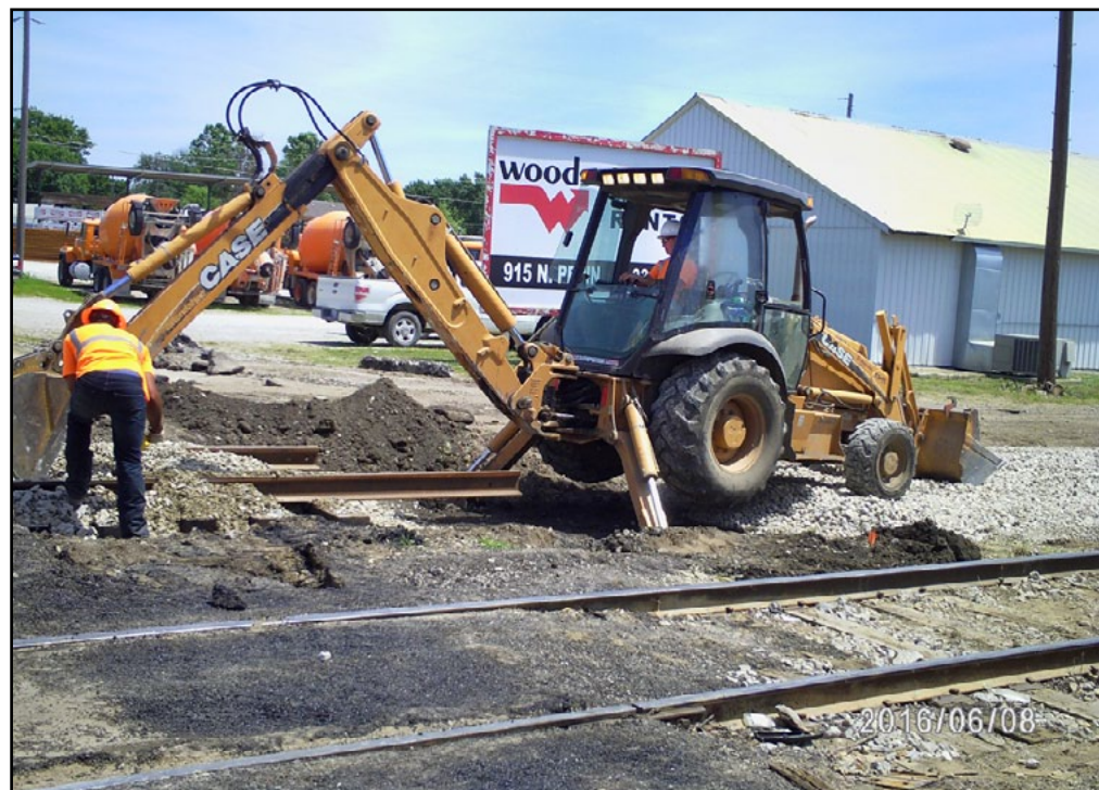
New track installation is underway along the SKO Railroad in Independence.

New track: Work is progressing quickly on a project to improve SKO Railroad access to the Beachner Grain Facility in Independence. The project, which began in late May, will construct 1.5 miles of new mainline track. The goal is to have the work completed by harvest season later in the summer and fall. By constructing new mainline track, the original track can be converted into siding for the company. Beachner will increase on-site storage to 395,000 bushels from 135,000. The improvements will allow SKO to serve the facility from both ends. KDOT is providing SKO more than $530,000 through a loan and grant for the project, which has a total cost of more than $757,000.