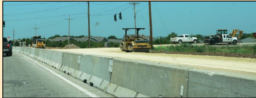
Work on U.S. 77 near McFarland Road.