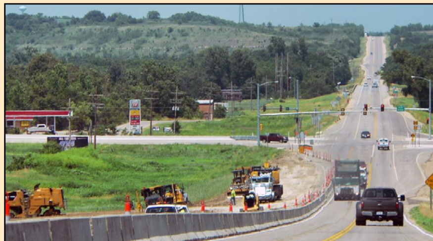
Construction at the U.S. 77/U.S. 57 junction.

Progress along U.S. 77: The series of improvements on U.S. 77 at Junction City continues to dominate the landscape in the area. At the I-70/U.S. 77 interchange, redesigned ramps are under construction in preparation for the conversion of the traditional interchange into a diverging diamond interchange (DDI). Lanes are being extended as needed and a new traffic light at U.S. 77 and Goldenbelt Boulevard north of the interchange is planned. In addition to the DDI, improvements have been made at the Rucker Road/U.S. 77 intersection. The U.S. 77/Walla Walla Road intersection has been removed and construction is underway to add a southbound climbing lane for the hill on U.S. 77 south of the improved four-lane U.S. 77/U.S. 57 intersection. Construction on these projects will be finished this year. Work on the DDI will continue into 2017.