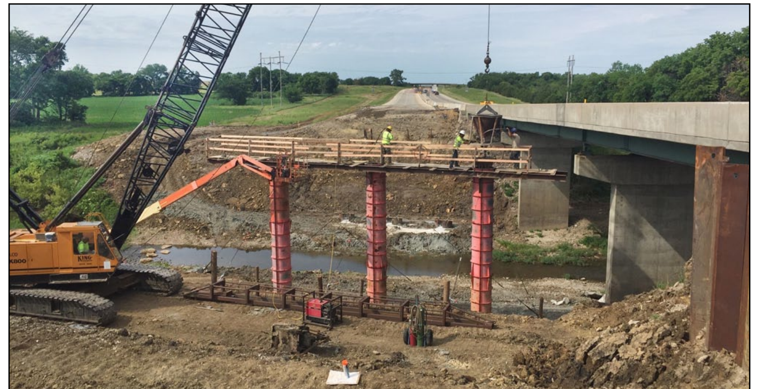
Crews pour concrete columns for new Osage County bridges at MM 157 on I-335/Kansas Turnpike.