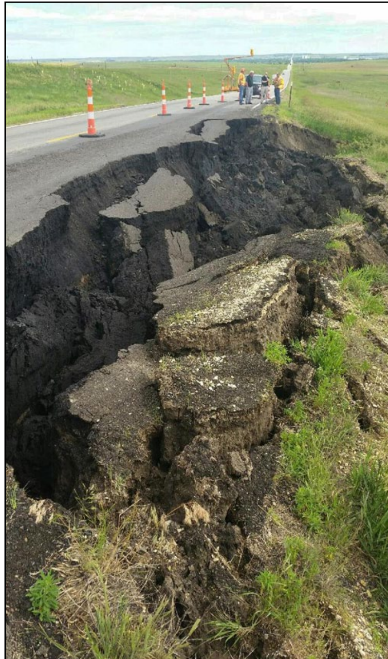
Two weeks after the first slope failure due to heavy rains in May, a second slope failure took place on U.S. 281 south of Osborne about 100 yards from the first failure. The Osborne, Smith Center and Stockton Subareas, the Phillipsburg Area and District bridge crew are working on the repairs.