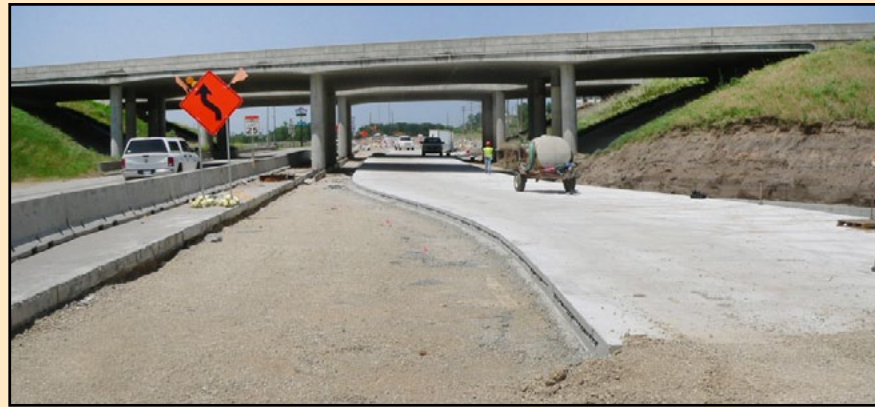
U.S. 77 ramp work under the I-70/U.S. 77 interchange.