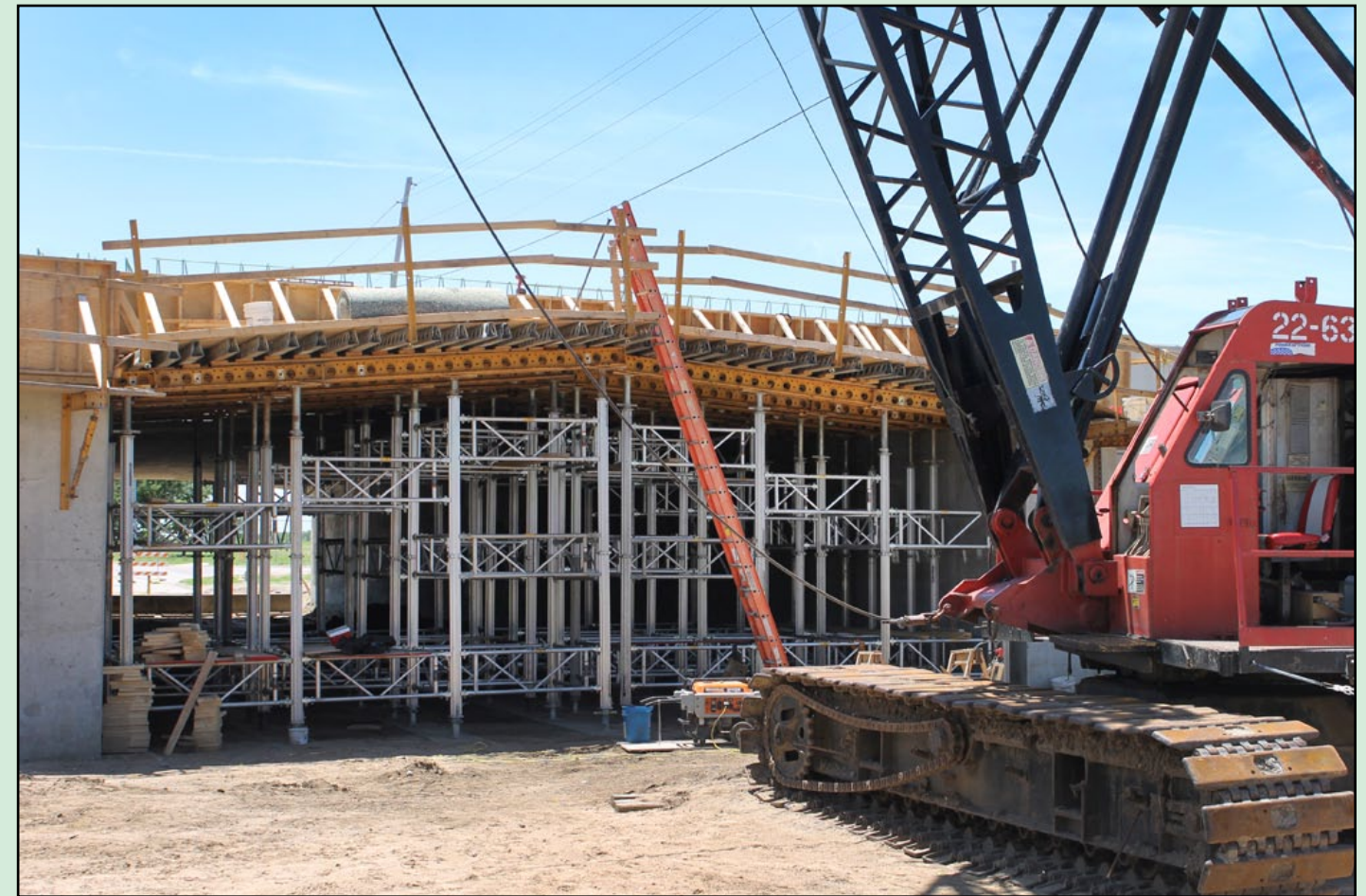
False work is in place for a bridge widening on westbound U.S. 54 over Hoover Street in west Wichita. Traffic from northbound and southbound I-235 will merge over the Wichita-Valley Center Floodway, then accelerate onto U.S. 54.