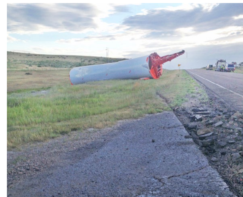
With an increase in wind farms, District Three has been busy routing oversize and super loads. This load was westbound on U.S. 36 east of Atwood on July 13, when the trailer jackknifed, nearly tipping the semi over. The 112,000-pound load came off of the trailer and both ended up in the south ditch. There were no injuries, and the Atwood Subarea crew repaired the pavement damage.