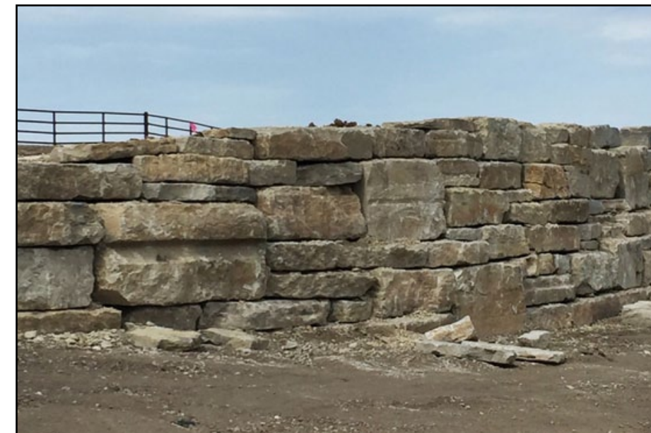
Work continues at the Bazaar Cattle Pens located at MM 110 on I-35/Turnpike. Recently, stone walls have been constructed and paving completed.