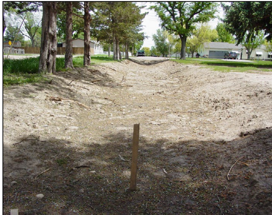
A drainage ditch was built to reduce runoff problems once upgrades to the Syracuse Subarea are complete.