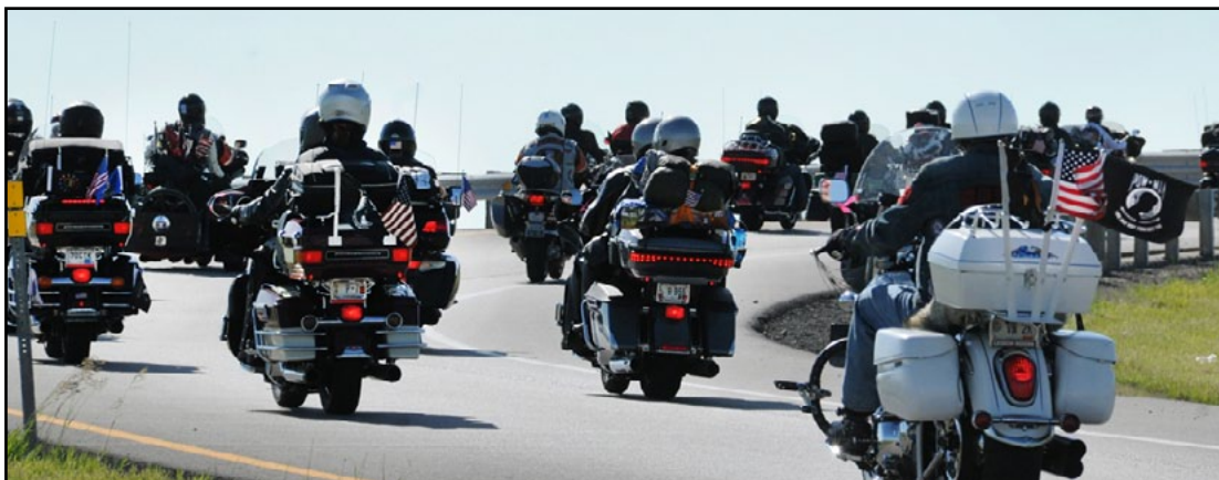
People wave to the participants in the Run for the Wall event (above) as they leave the service area and continue their journey to Washington, D.C. (left).