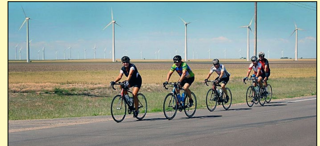
Bicyclists should follow the same rules of the road as drivers.

Share the road with bikes: May is National Bike Month and gives people an opportunity to highlight the benefits of bicycling. According to the League of American Bicyclists, the number of bicycle commuters in the U.S. grew more than 62 percent from 2000 to 2013. Many of the reasons include saving money on gas, helping the environment and enjoying the sport. A few tips to remember while bicycling: ♦ Always wear a helmet ♦ Obey the same rules of the road as drivers ♦ Ride on the right side of the road ♦ Be aware of motorists around you