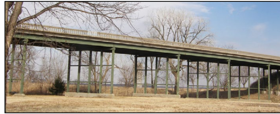
At left is the old railroad overpass on K-39 at the eastern edge of Chanute, and below is the new bridge that has replaced it. B&B Bridge of St. Paul was contractor on the $1.7 million project, which lasted one year. The new bridge has a 44-foot roadway and is lower than the previous structure. A section of the Katy Hike/Bike Trail that runs underneath was paved as part of the project.