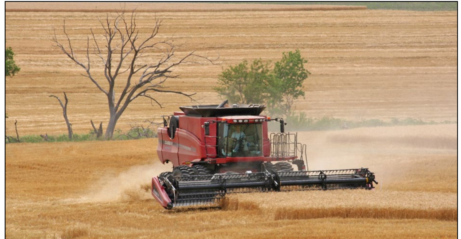
Most of the wheat harvest in Kansas wrapped up last week. KDOT employee Neil Croxton took this photo recently in Ottawa County.