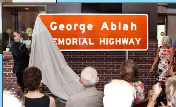
Above, Wichita KDOT employees install the George Ablah Memorial Highway sign.