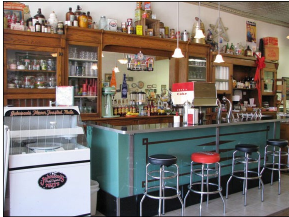
The soda fountain in The Old Store in Johnson has an original 1920 oak back bar.

The Potwin Drug Store in Topeka has the oldest operating fountain in the state. It's been in operation since 1902 in the Old Prairie Town at Ward-Meade Historic Site. The 1950's Stanley Knight soda fountain at The Old Store in Johnson, located in the far southwest corner of the state, is in an