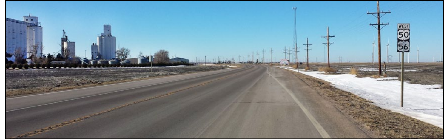
A preliminary engineering study is taking place on this section of U.S. 50.