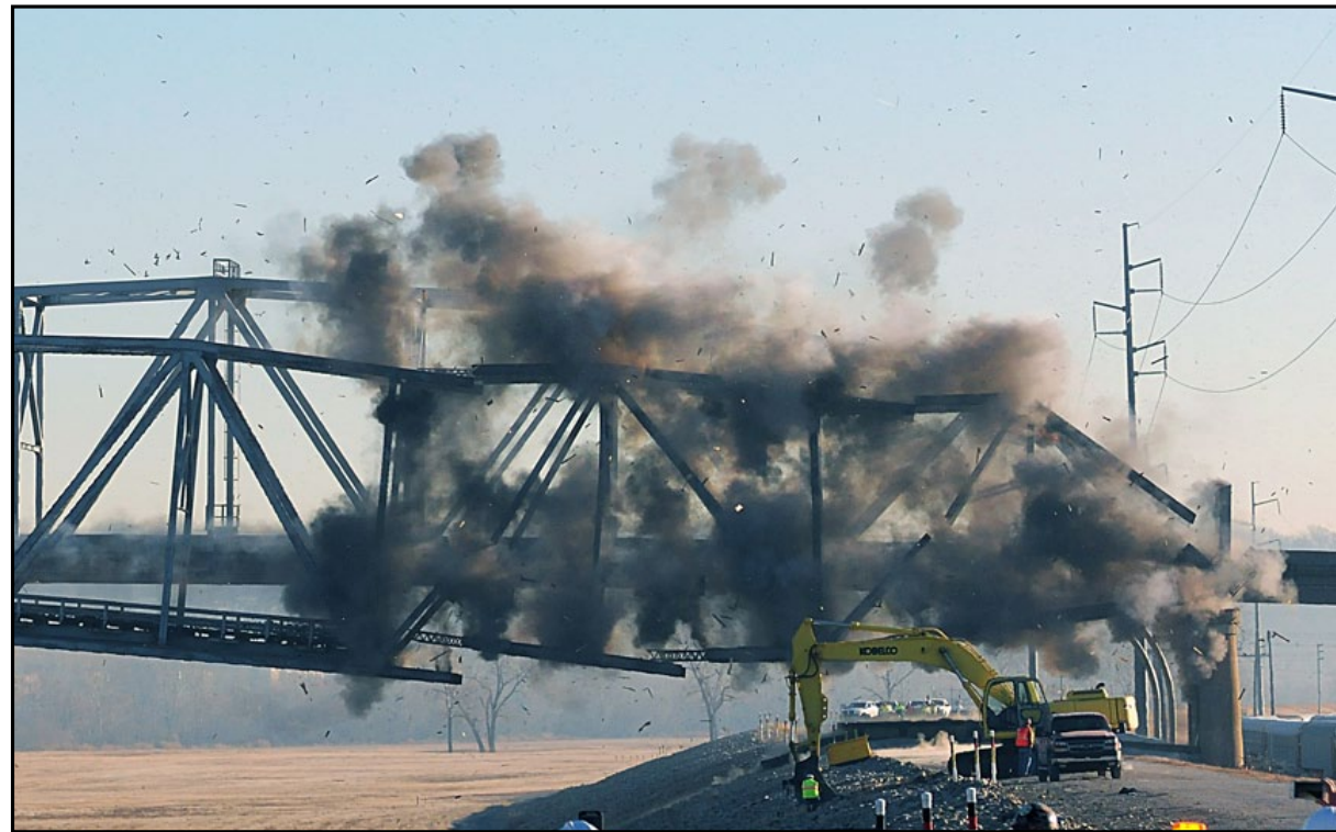
The first section of the U.S. 69 bridge is imploded.

Bridges crossing the state line in northeast Kansas are jointly shared by KDOT and MoDOT, though the lead authority is alternated. Currently, MoDOT is heading the U.S. 69 Missouri River Bridge design-build replacement project, while KDOT is heading the Route 92 Centennial Bridge study. Both bridges span the Missouri River.