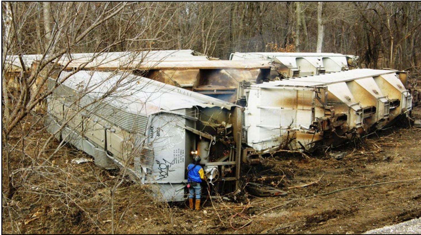
A Union Pacific Railroad employee stands next to one of the derailed cars alongside K-39 in Wilson County. A train with two engines and eight empty cars collided with a grain truck the morning of Jan. 15, derailing the train and shutting down the highway between U.S. 400 and U.S. 75 until the early hours of Jan. 16. The collision also resulted in three injuries, none were serious.