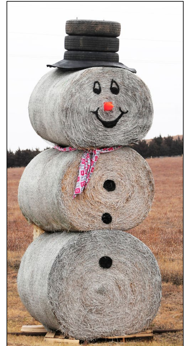
This giant snowman didn't require a lot of snow, just hay bales, tires and some creativity. It is located on the county road east of Hunter.