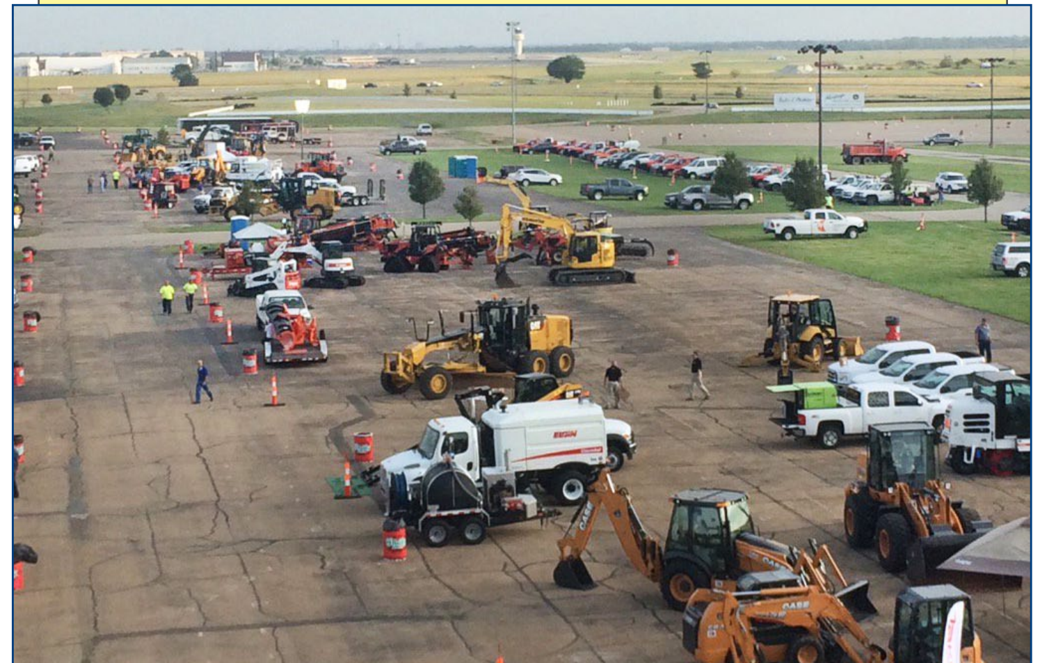
Nearly 90 vendors gathered to bring information to attendees at the KTA's second Kansas Winter Expo that took place in Wichita on Sept. 7 and 8. More than 600 people attended - doubling the number of people who attended last year. In addition, almost 200 high school students attended the job fair.