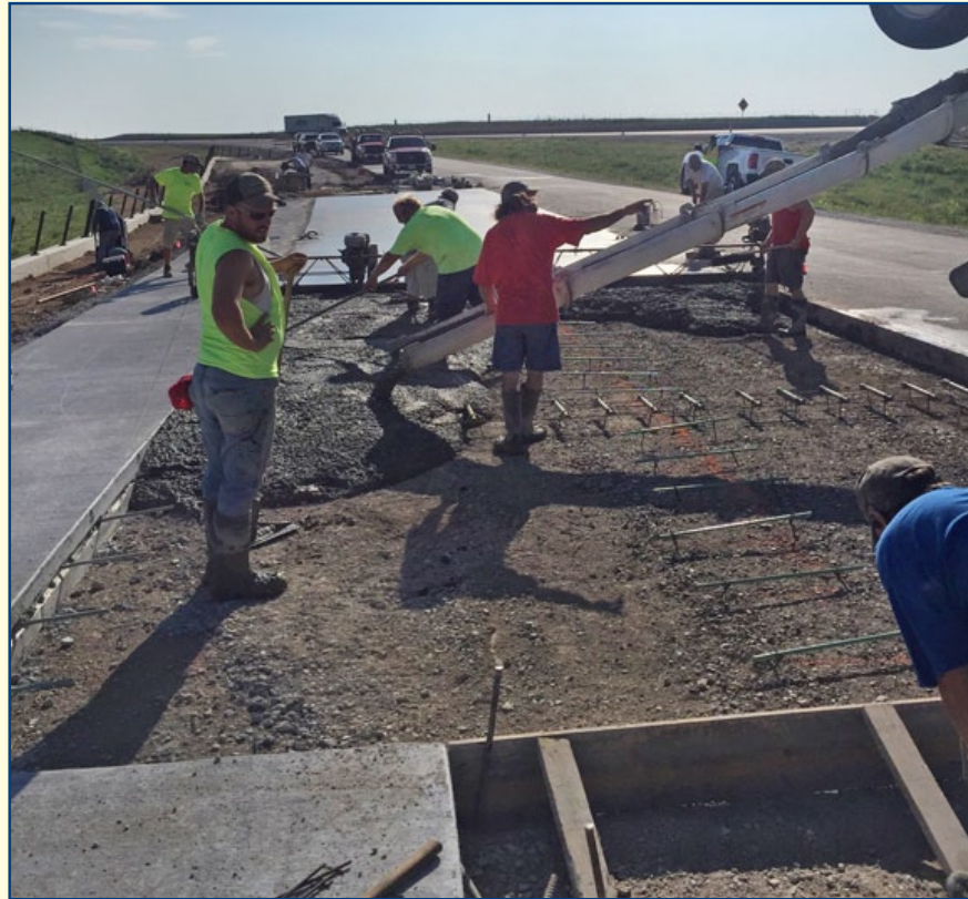
Crews pour concrete for the parking pad at the Bazaar Cattle Pens improvement project along the Kansas Turnpike.