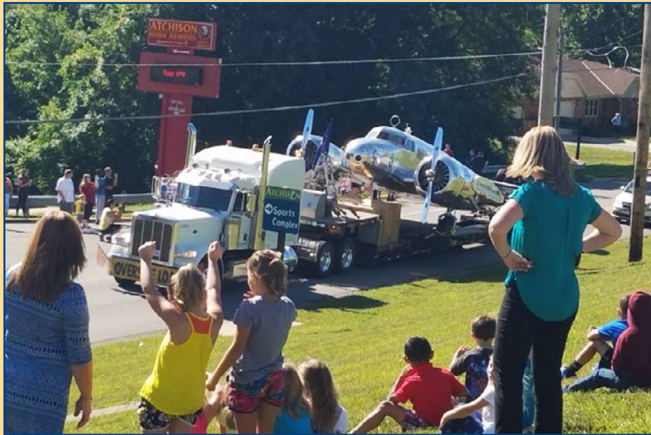
Muriel, the world's last known original 1935 Lockheed Electra L-10E, makes her way along the streets in Atchison. More information about this plane and its journey are in this edition.