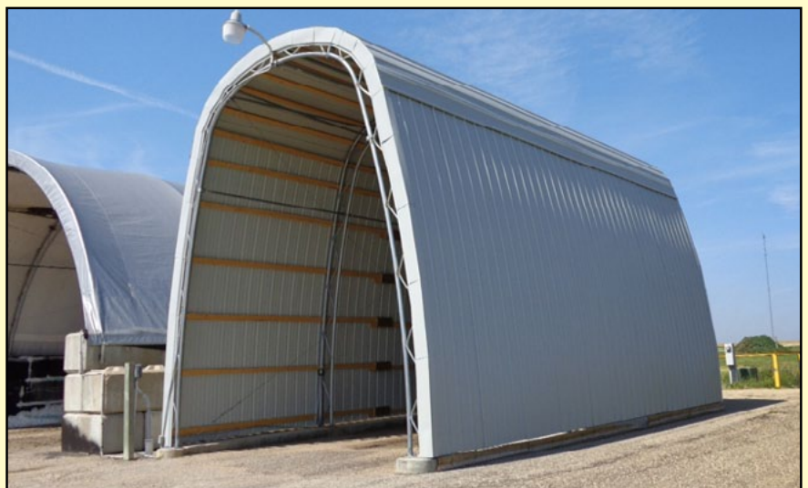
Employees at the Ellsworth Subarea office placed tin sheeting on this equipment shelter to help improve its durability.

The solution was to reskin the shelter with tin sheeting. This shelter will be home for a tractor with a loader attachment this coming winter and should serve the Subarea crew for years to come. It was built on one of the largest mixing strips in District