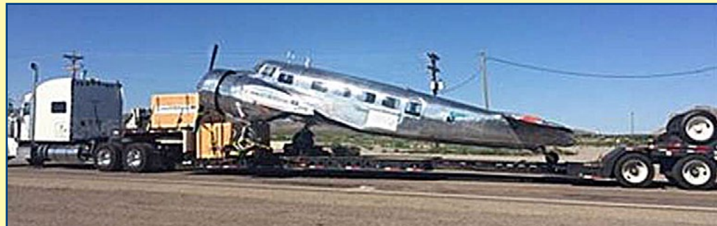
Muriel traveled from California and arrived in Kansas on Aug. 22.

The world's last known original 1935 Lockheed Electra L-10E named "Muriel" began her journey home to Atchison on Aug. 15. Muriel is the last of the 14 L-10Es built and identical to the plane Amelia Earhart and her navigator,