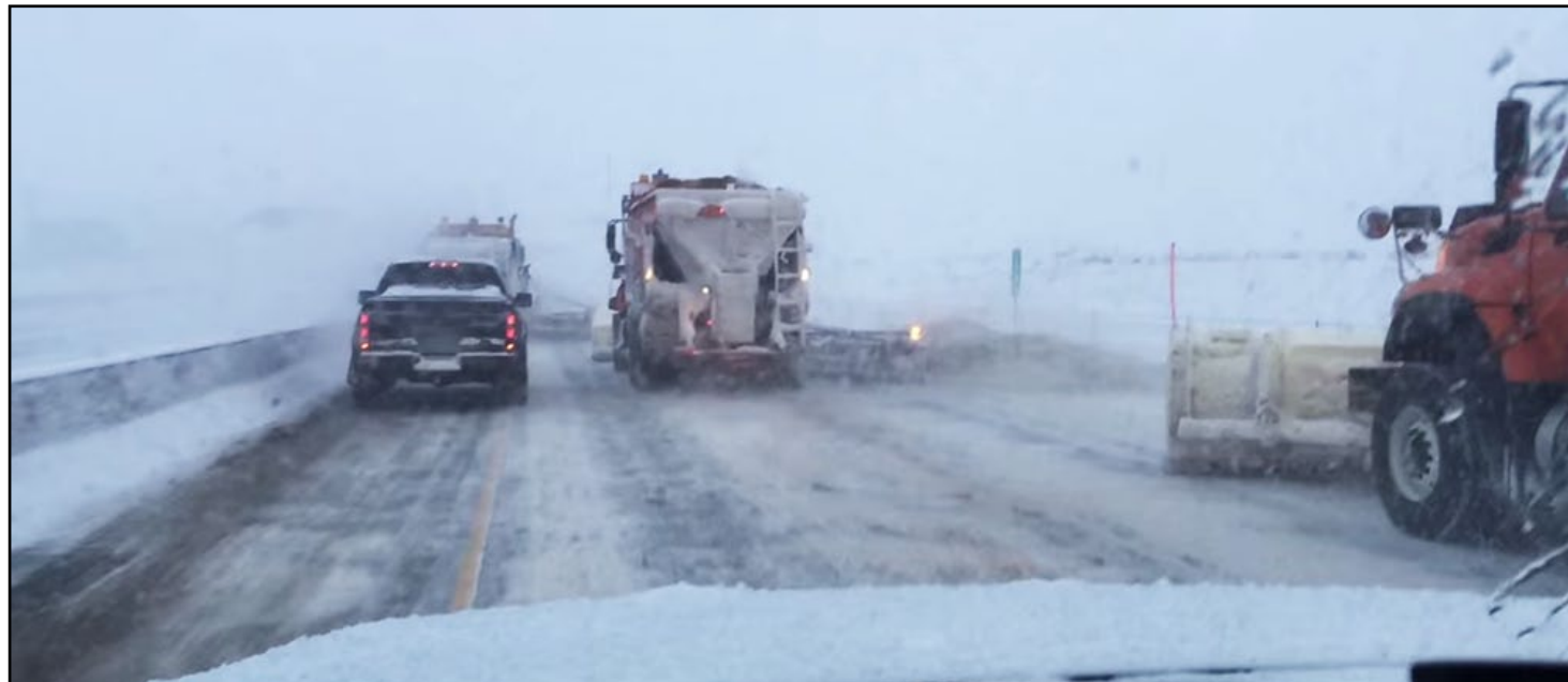
The pickup truck at left cuts in front of the middle snow plow while crews clean a highway in Colorado.

Driver weaves through CDOT snowplows: According to a story in Better Roads, the Colorado Department of Transportation caught a reckless driver weaving through snowplows on a dashboard camera and is using the footage to remind drivers to be safe.