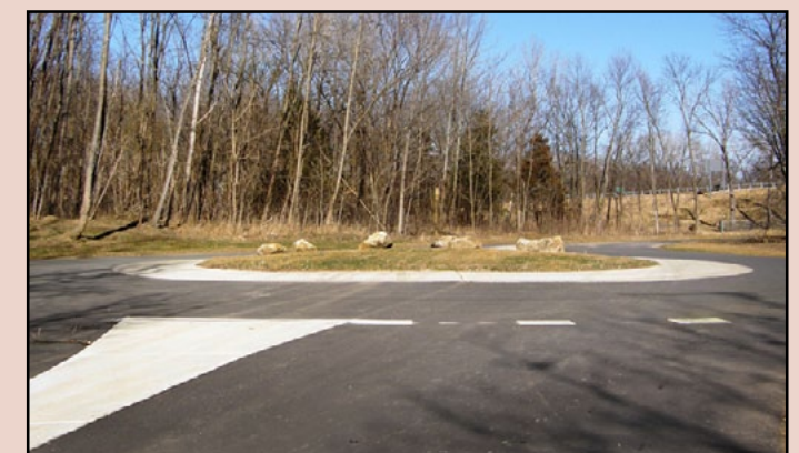
Above, Fort Scott Riverfront Park; left, U.S. 160 Elk River Bridge.