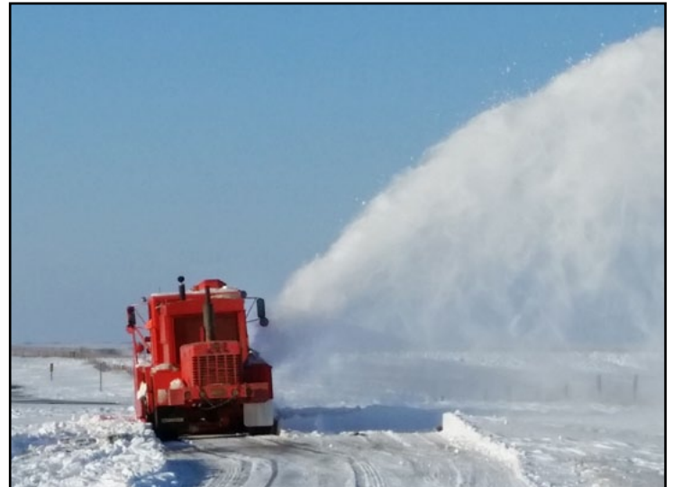
Left: Near white-out conditions during the storm. Above: Clean-up continues on K-60 with the snowblower.

Big storm: The massive winter storm and high winds that hit Colorado, Nebraska and Kansas on Feb. 1 and 2 closed many highways in central and western Kansas. Westbound I-70 was closed to Salina because of high winds blowing snow and semis stranded along the highway. Sections of most of the highways from Hays west to the Colorado border and from Hays north to the