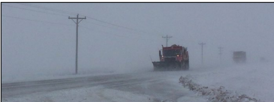
Above: U.S. 83 south of Scott City. Right: Semi-trucks, with no where else to park, parked along U.S. 183 north of Hays (photo submitted).

According to the National Weather Service in Goodland, wind gusts up to 55 mph were reported throughout the region and snowfall totals in the northwest area included Logan, eight inches; Colby, 11 inches; Goodland and Norton, 12 inches.