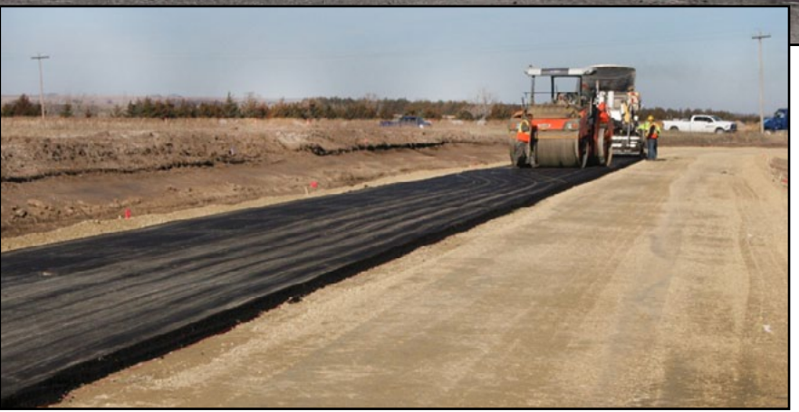
Top photo: Striping and finishing touches take place on the new K-258 pavement. Above: Paving on the new alignment was under way earlier this year.