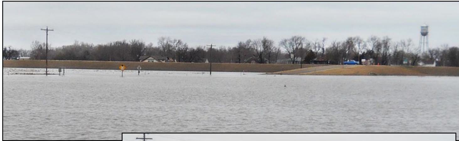
The Abilene Subarea crew was called out to flag K-4 highway traffic following flooding caused by the three-plus-inch rains in south Saline County on Dec. 13 and 14. Flooding occurring over both lanes of K-4 from Gypsum east and south for about three miles is shown above. At right, Equipment Operator Layne Schiffner looks at the conditions on K-4 near Gypsum. K-4 was reopened to traffic mid-day on Dec. 15.