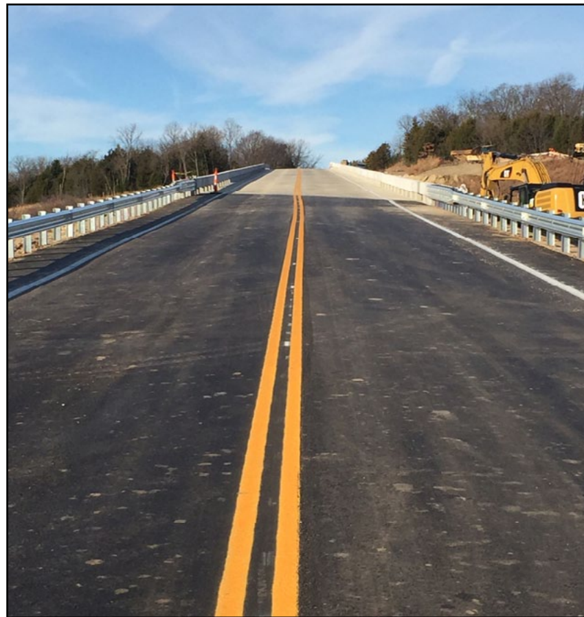
The newly-constructed Kansas Avenue Bridge in Leavenworth county opened to traffic on Nov. 23. Crews are still in the area for demolition of the old bridge and construction of a new median barrier on I-70/Turnpike. Travelers should expect lane drops and construction activity near the roadway until mid-December.