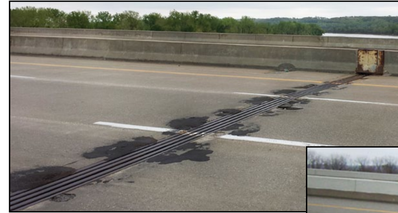
Before and after photos of the bridge expansion joints on the southbound I-435 bridge show a few of the improvements on the bridges since the project began in April.