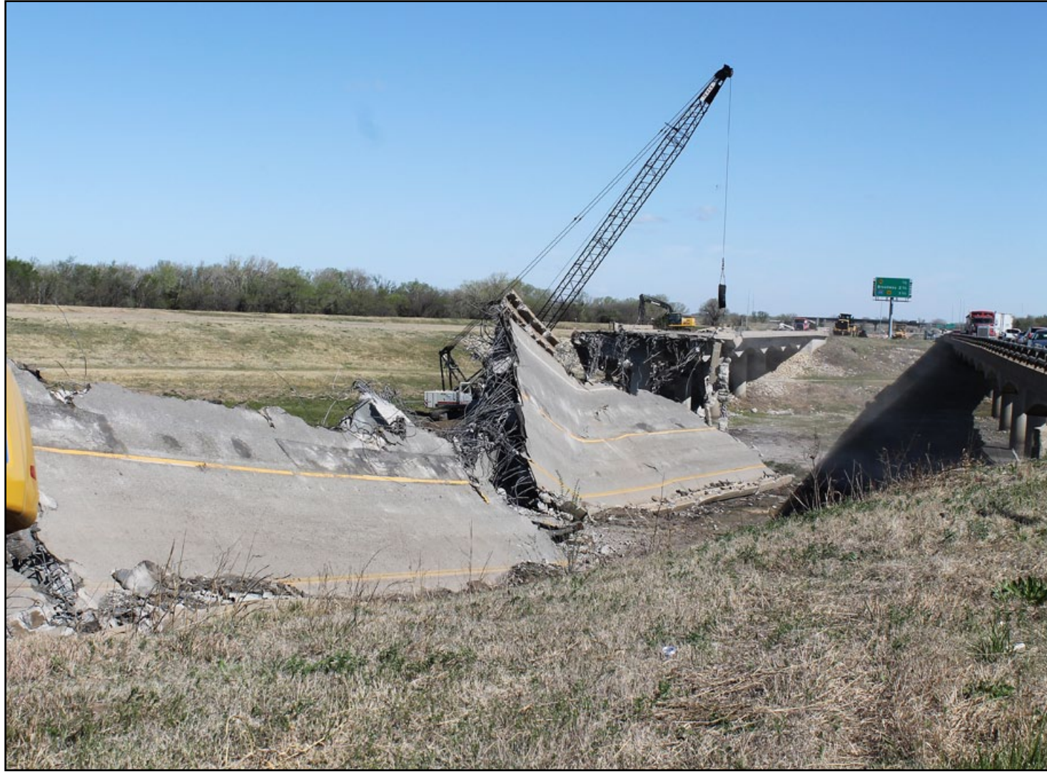
The demolition of the southbound I-235 bridge over the Wichita-Valley Center Floodway in northwest Wichita started today. Part of the “Five Bridges” project, two southbound bridges will be rebuilt this year and two northbound bridges plus the 25th Street bridge over I-235 will be constructed in 2017. Traffic is single lane, head-to-head and can be seen on the right. About 40,000 vehicles used this part of I-235, at least, before construction began in late-March. Kelly Keele’s road squad and Mark Hurt’s bridge squad designed the project.