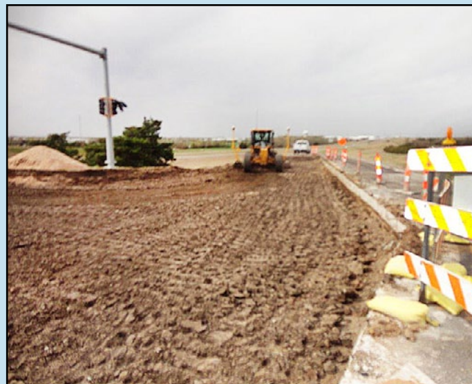
Pavement removal is taking place between the I-135 ramp and Champlin Street.

U.S. 56 work begins: Construction on U.S. 56 from the I-135 ramp west to the U.S. 56/Eby Street intersection in McPherson began in late March. The project will reconstruct the four lanes including shoulders and replace the grass median with concrete. This project includes bridge rehabilitations, review of crash wall requirements at railroad bridge piers, hike/bike trail, sidewalk and installation of conduit and light pole footings for a city lighting system. Traffic will be reduced to one lane in each direction. This section of U.S. 56 also functions as Kansas Avenue through McPherson. During construction, a temporary traffic signal will be at the U.S. 56/Centennial Road intersection and the two permanent signals within the project will be modified. Reconstruction of the eastbound lanes will then take place with the entire project schedule to be completed in July 2017. Mark Hurt's bridge squad designed the project.