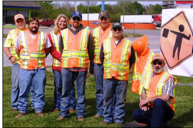
KDOT employees at the Independence Area Office wear orange to promote work zone safety.