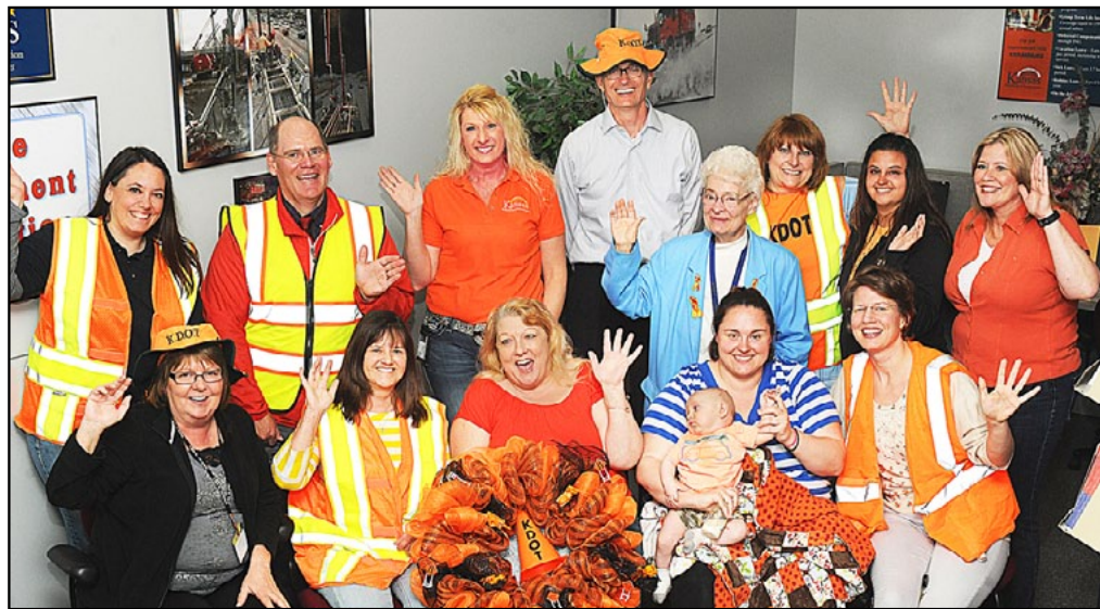
Above: KDOT employees in Eisenhower participate in Go Orange Day. Left: Names of all the KDOT and KTA employees who have been killed in work zone crashes since 1950 were on display at the statewide work zone safety news conference.