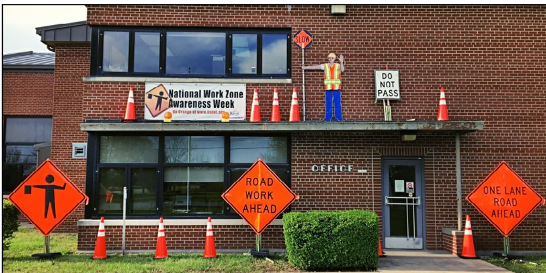
Top right: The Johnson County Public Works Department placed cones and a sign along the entrance to their campus on old U.S. 56 in Olathe. Left: The KDOT Pittsburg Area Office created a work zone safety display in front of the building.

Last year in Kansas work zones, 480 people were injured and four people were killed.