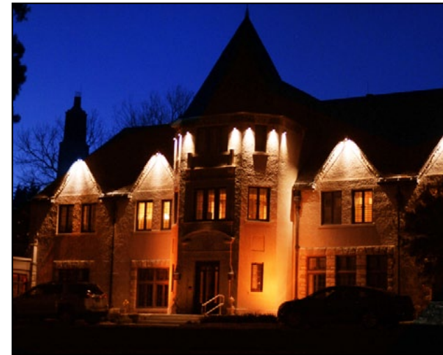
Cedar Crest, the Governor's Mansion in Topeka, was lit in orange last week.