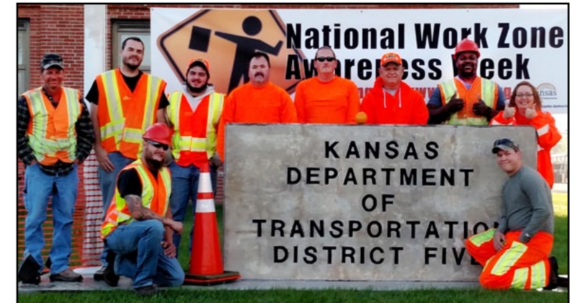
Above: KDOT employees at the Hutchinson office wear orange. Below: KDOT employees at the annual Maintenance Meeting in Salina pose for a photo.