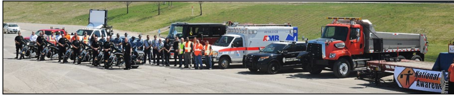
Transportation and emergency response partners set up a vehicle display at the news conference on April 13.