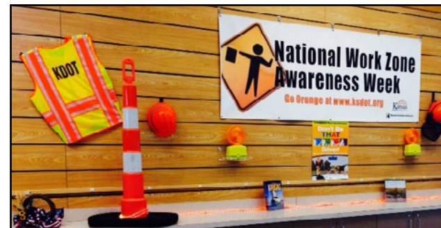
The Visitor Information Center near Goodland promotes work zone safety.