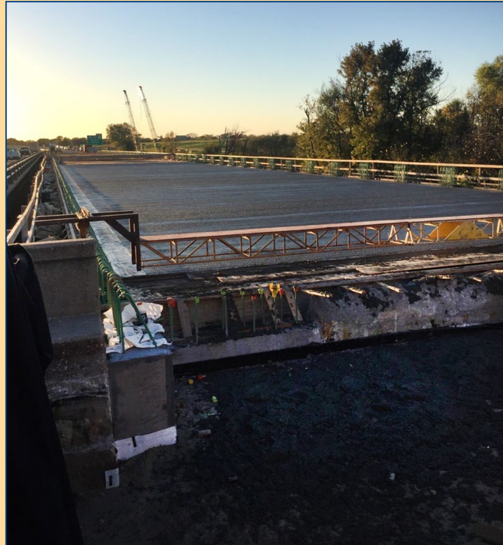
Crews complete the concrete pour for the Arkansas River Bridge (I-35/KTA mile marker 44.3) deck after 10.5 hours.