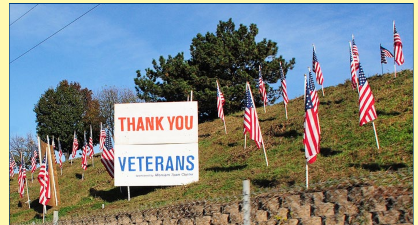
A display on a hill along I-35 near Johnson Drive in the Kansas City metro area honors and thanks veterans for their service. The photo was taken just before Veteran's Day, which was Nov. 11.