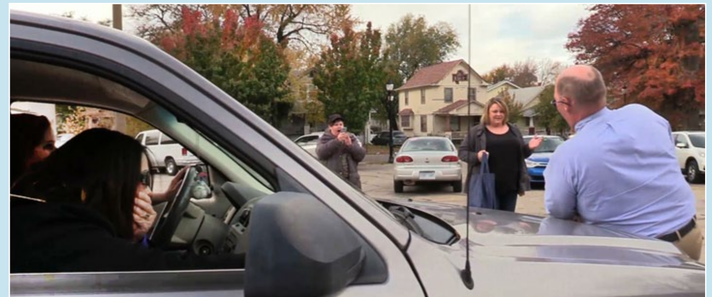
A snapshot of the KDOT mannequin challenge video shows a person getting hit by a distracted driver.

KDOT Mannequin Challenge: Last month, members of the KDOT headquarters staff and members of the community capitalized on the mannequin challenge social media phenomenon and created a PSA to encourage travelers to put the phones away while driving. A mannequin challenge is successful when everyone in a scene appears to be frozen as if they are in the middle of an activity. This mannequin challenge scene plays out as if a pedestrian, who had been texting and walking, was hit by a driver who was texting and driving. A tagline reading, "Texting and driving could bring your life to