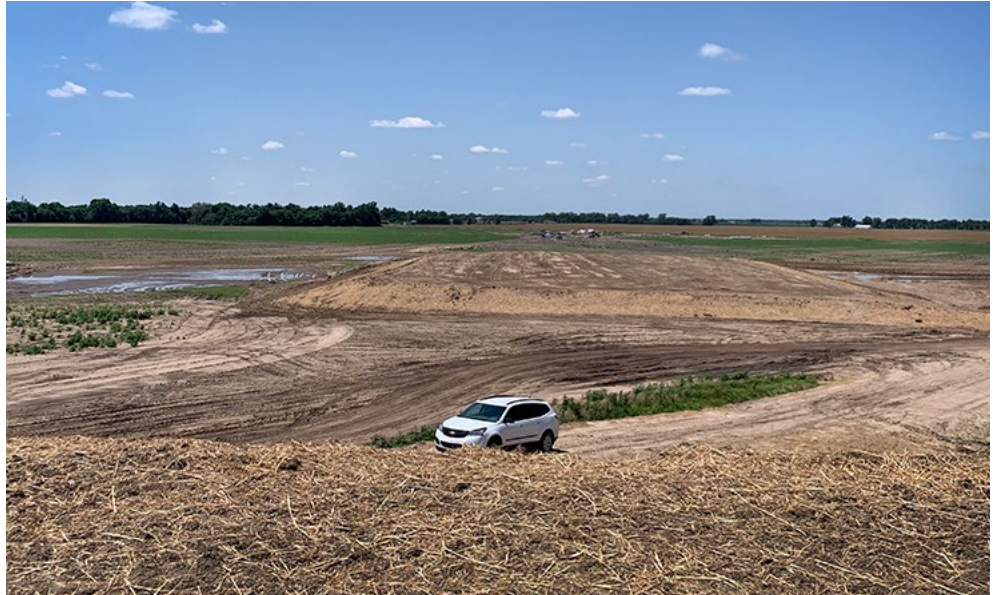
A view atop a berm at the future interchange north of Sterling.

It's not every day that KDOT builds a new highway across a sea of remote farmland and back roads where meadowlarks – and yes, buffalo – roam between farm fences. This is soybean-fields-and-grain-truck country. It's not every day that you see a large section of