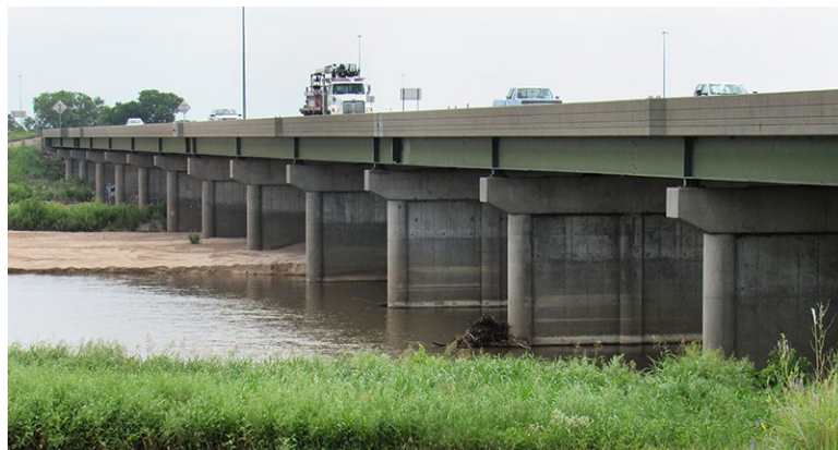
The Ark River northwest of the I-235/K-96 interchange in northwest Wichita has enough flow to float your boat – if it’s a canoe or kayak.

The Ark (pronounced Arr – Kansas) River originates in a rocky crevice near Leadville, Colorado, flows through the Royal Gorge, is thinned considerably in eastern