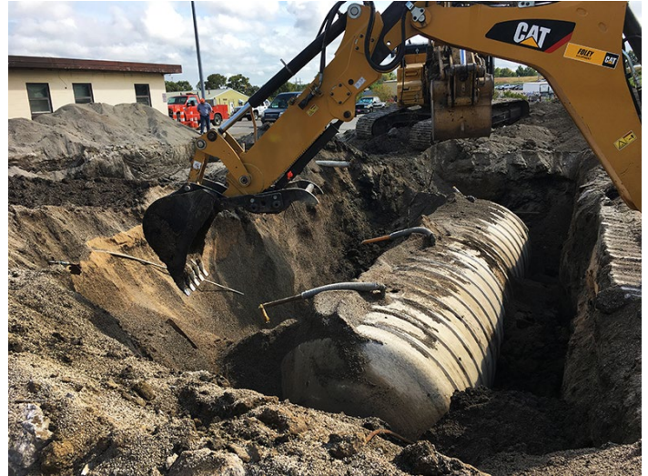
Above, the fuel tanks are removed from in front of the Gage main complex office, which is shown below.

The construction project is expected to be completed in fall 2021.