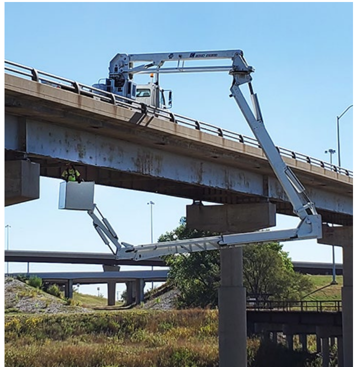
Inspections take place on the eastbound U.S. 54 to southbound I-235 ramp.

The KDOT bridge inspection team is based out of Topeka and inspects every bridge on all state highways, K routes, U.S. routes and interstates.