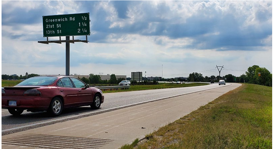
Work on K-96 from Webb to Greenwich roads will provide a better riding surface for motorists.

“We hope this project buys a lot more life to this pavement. The roadway is at capacity at many locations with the amount of lane space that’s available. So we’re looking at other options for the future at what to do with