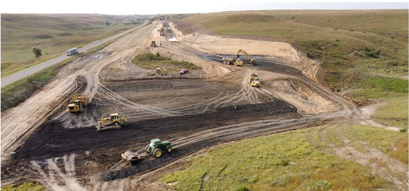
Sporer Land Development provided this photo from their drone of crews backfilling a reinforced concrete bridge extension on the U.S. 281 modernization project in Russell County. The new alignment section can also be seen in the background.

To see a list of all the projects, click here .