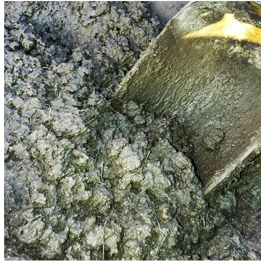
This photo shows fiber mixed in concrete.

How it works: The fibers help prevent minute cracks from developing as the concrete cures and shrinks, by reinforcing the concrete, Squires says. It leaves the bridge deck with a more durable surface, he says. District Five started using the microfibers last year.