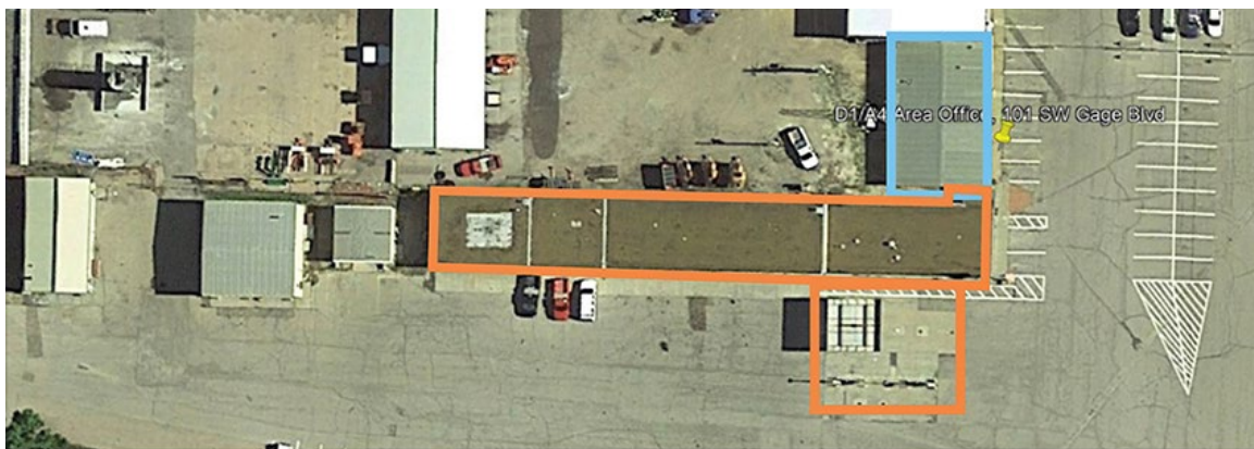
The aerial photo at left shows the part of the Gage office being demolished and the part being remodeled.