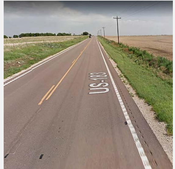
Photos show a section of U.S. 160/183 south of Coldwater before and after 2-foot shoulders were added. Now, KDOT plans to add shoulders on U.S. 183 north of Coldwater, in Comanche County, and continuing into Kiowa County.

to add a lot ... because we've got a lot of big, oversized loads that come down through there. It would be a tremendous help."