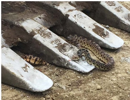
A large bull snake slithered into the bridge project at one point, proving the need to always wear sturdy footwear and watch where you’re walking.