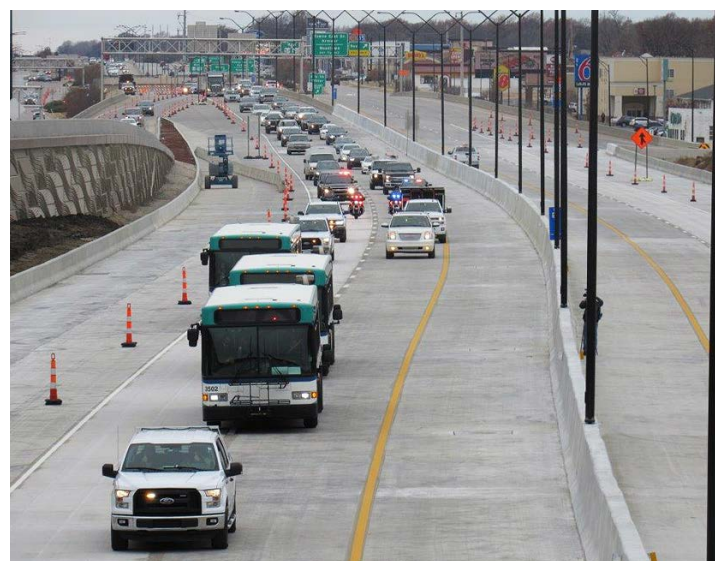
Law enforcement leads officials and other motorists as they drive on the newly-opened stretch of freeway.