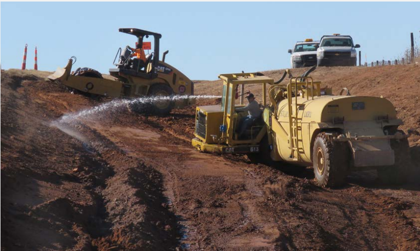
At a cost of $95,000, the project replaced a section of guardrail and increased recovery zone for vehicles traveling in the area.