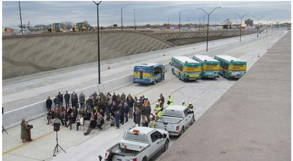
Attendees gather on a stretch of Kellogg freeway to celebrate its opening on Nov. 21 in Wichita.

The Greenwich Road piece started later and finishes in late 2021. It picks up west of Greenwich and continues east over Zelta Street to a new access for the KTA and ends at the K-96/U.S. 54/400 junction.