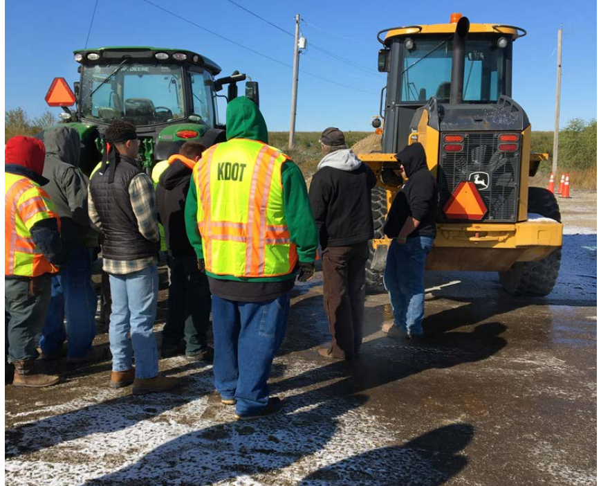
Employees at the Oakland Subarea learn about proper equipment maintenance while participating in snow and ice training.

In addition, new employees attend the winter safety class where the District Safety Specialist discusses