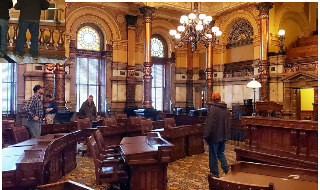
District One Engineer Leroy Koehn gave employees the option of touring the Capitol during a planned power outage at the main office on Nov. 21.