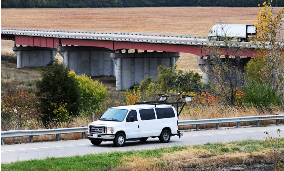
KDOT's "Star Wars van" travels on highways across the state gathering data for the pavement management system.