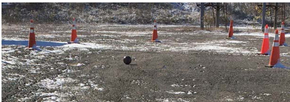
A training method borrowed from District Four involves trainees driving a snow plow on a course and pushing a bowling ball into a goal, which requires depth perception and hand/eye coordination.

safety precautions of extreme weather conditions, what to wear and how to prepare for working long hours. They also go over the truck and attachments with a mechanic and learn about common break downs and preventative measures. The mechanic also goes over proper clean up procedures with the equipment after the snow and ice event is over.