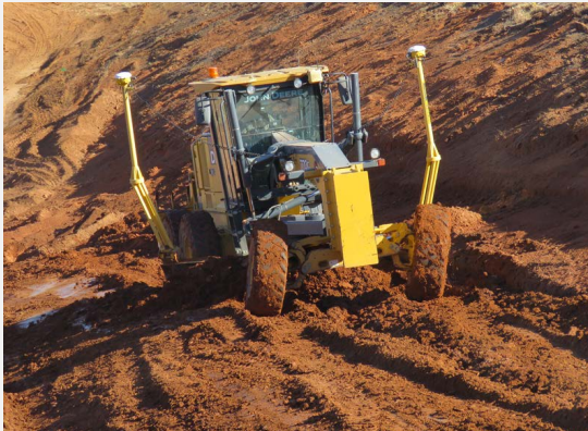
Stoppel Dirt, LLC of Sublette recently completed a grading and dirt work project on U.S. 160 in Clark County.