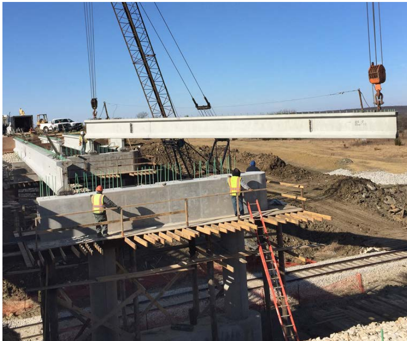
Construction continues on the new South Kansas & Oklahoma Railroad overpass at the U.S. 166/U.S. 75 junction.