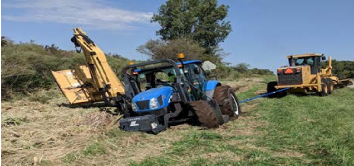
A tractor mower is pulled out with a motor grader and a tow rope. Photo provided