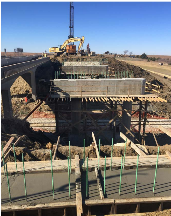
The existing overpass is on the left, south of the new bridge.