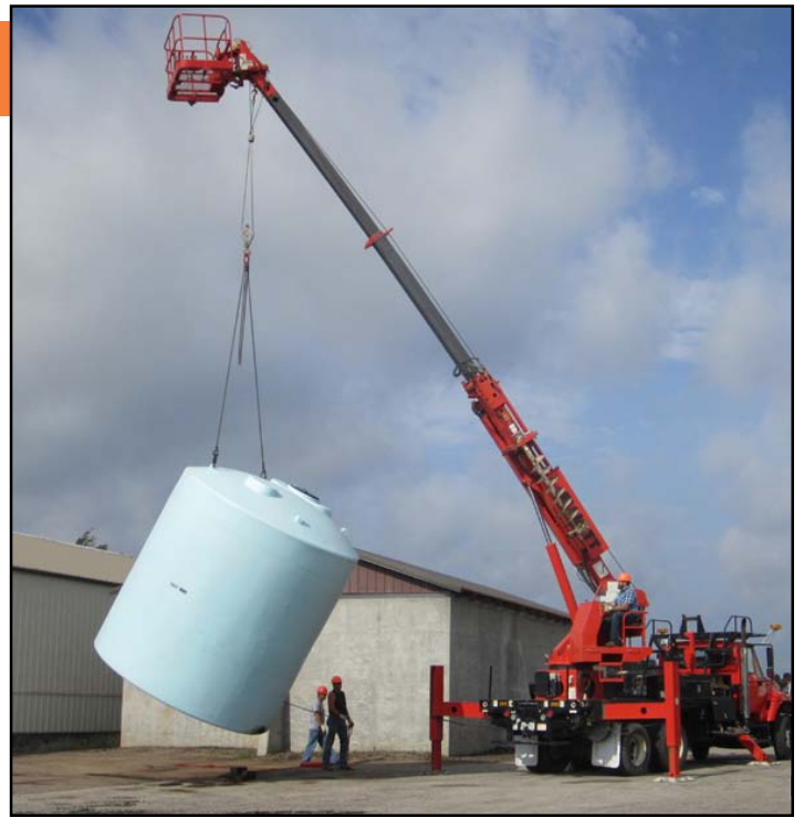
Crew members at the Wellington Area Office move a 10,000-gallon salt brine tank to another KDOT facility.

One of the biggest problems with spreading salt or spraying salt brine is that it will bounce off the road or traffic will knock it off from the tires or wind, Frye said.