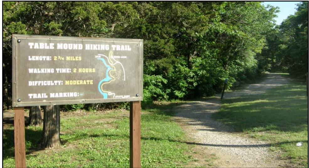
Lots of great trails and scenery can be found at Elk City State Park.

The lake is a regional favorite for water sports and fishing. Elk City State Park also has a swimming beach, campsites and playgrounds.