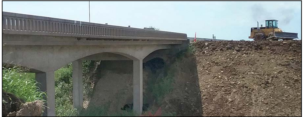
Work continues on the SKOL overpass on U.S. 166 in Montgomery County.