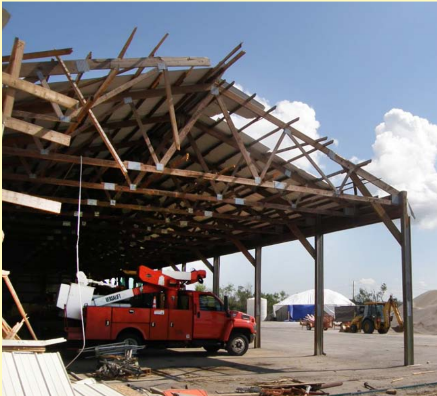
An EF-3 tornado moved through the city of Eureka last spring and damaged homes and buildings at the KDOT subarea office.