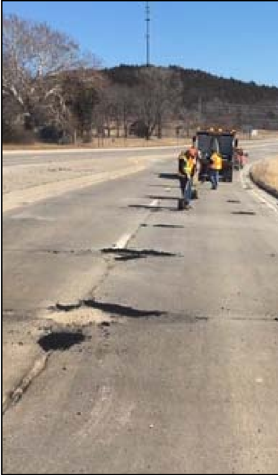
At right, nice weather on March 15 allowed members of the McPherson Subarea crew to patch potholes on I-135 south of the city of McPherson.