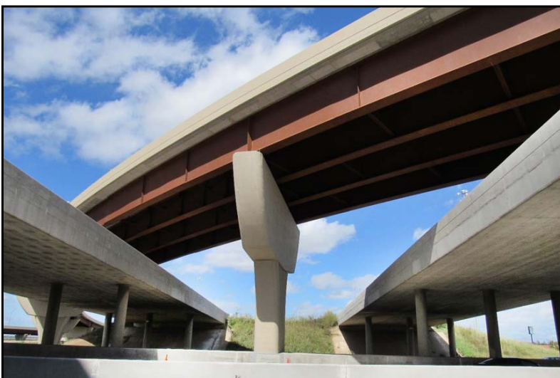
Above, dedicated directional ramps were added to the project. At right, a traffic camera monitors the construction area.

And future projects keep coming. Recently, a new three-year project on I-235 in north Wichita began that will replace six bridges, upgrade and expand travel lanes and reconfigure the I-235 and North Broadway interchange.