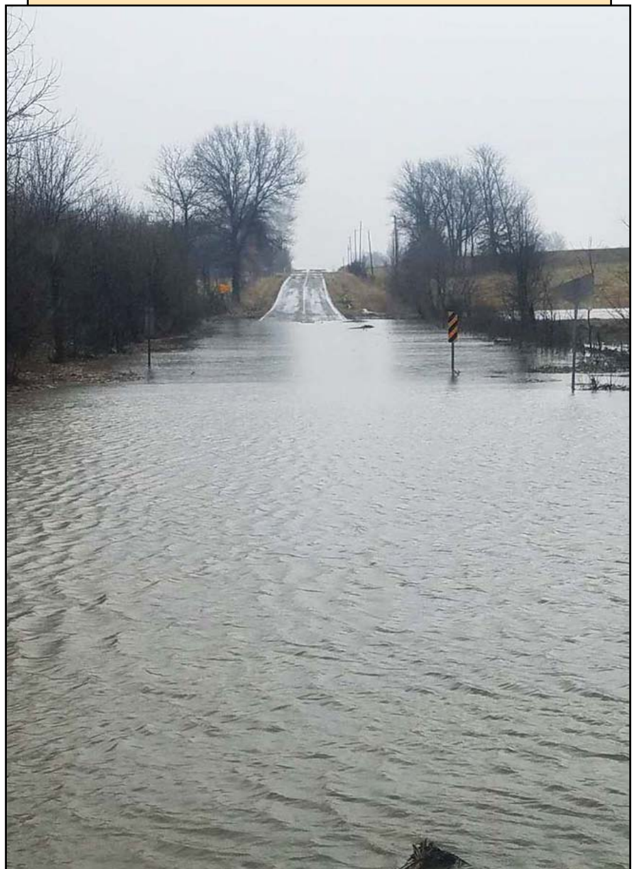
High waters flooded K-31 in the Fulton area east of U.S. 69. Heavy rains saturated the area the second week in March, closing the K-31 section for a day.