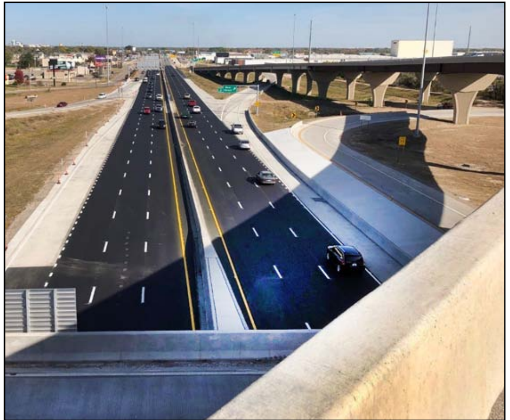
The I-235/U.S. 54 Interchange project opened to traffic six months ahead of schedule.

According to data collected during construction, as much