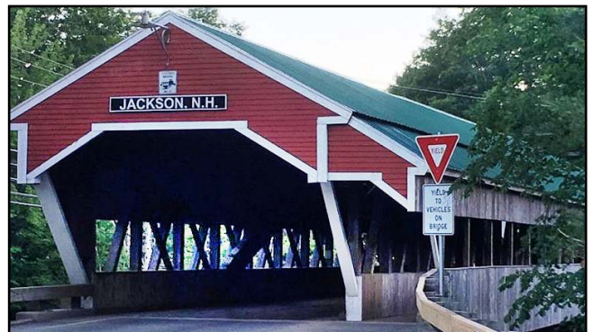
Bridge