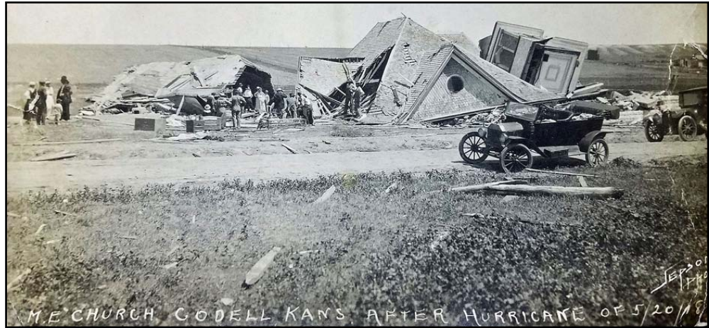
A church, above, and school, below, were destroyed on May 20, 1918.

The 1917 storm was another late afternoon event, this time affecting the west edge of town. A stronger storm at an F3, the twister caused more damage than the previous year. But no lives were lost and few were injured. At the time, it was considered one of the most extensive tornadoes to hit the area, until disaster would strike again the following year. Estimated at an F4 with wind speeds of more than 200 mph, the 1918 tornado was by far the largest and most destructive of the three. The twister spanned a path from Trego County to Osborne County, traveling approximately 60 miles over a six-hour period. Unlike the other storms, which hit