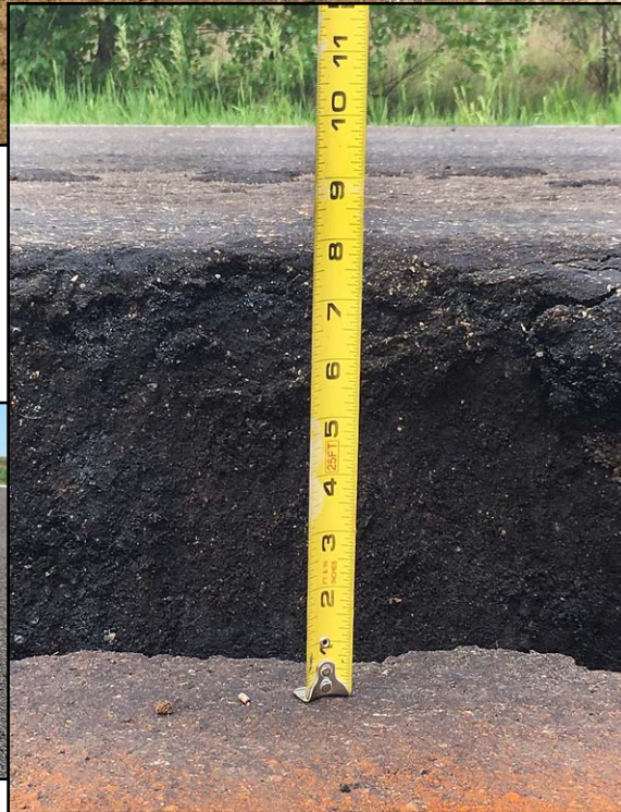
Above: A flagging operation had to begin on May 28 as the slide on U.S. 281 got worse. Far left: A picture of the highway on May 13 shows the highway slide starting. Left: This photo taken May 29 shows the eight-inch drop in the pavement.