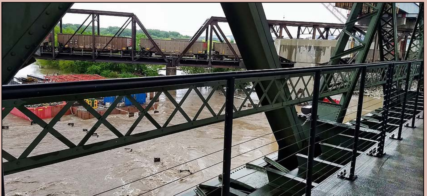
High waters are delaying work on the Lewis and Clark Viaduct reconstruction project.

Project delayed: Spring rains are delaying the completion of the Lewis and Clark Viaduct I-70 westbound bridge reconstruction as the pier sites are inaccessible due to high water. It was scheduled to be finished this December.