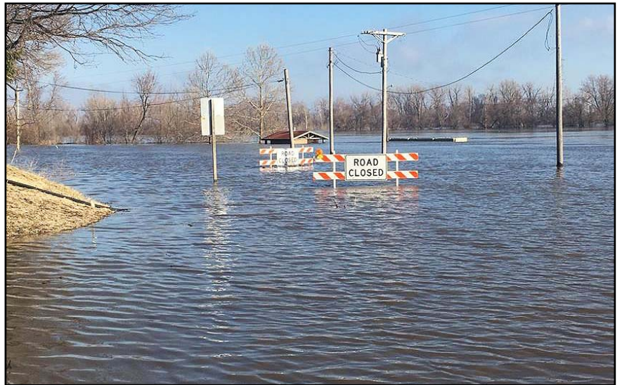
A view of K-7 flooding from White Cloud looking north.