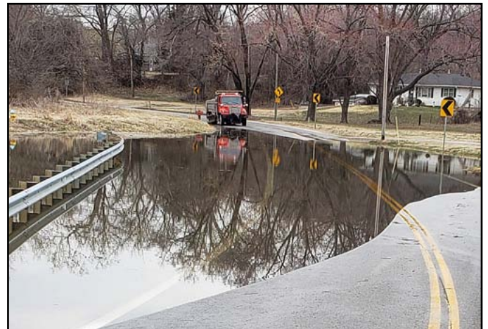
K-5 flooding at Lansing.