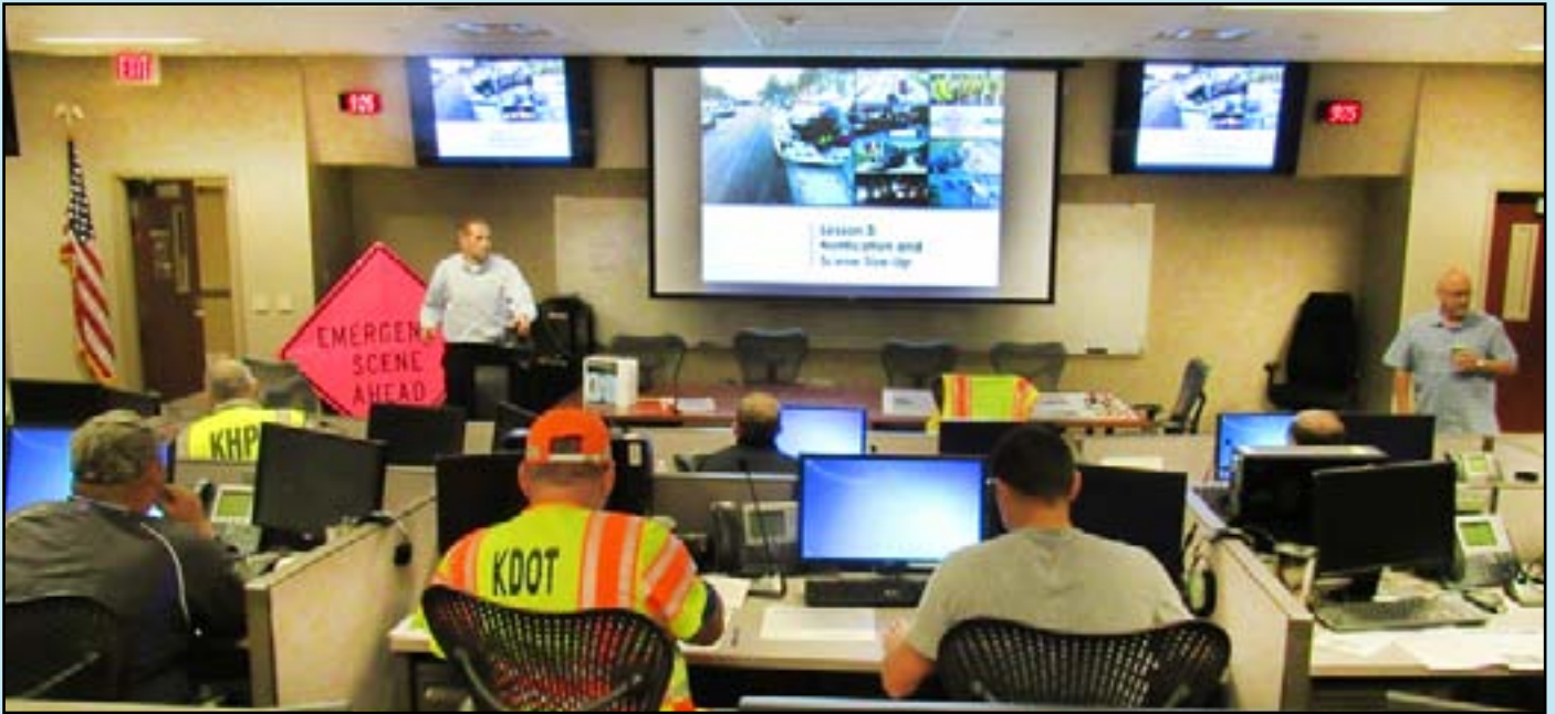
First responders participate in Traffic Incident Management Training in Wichita.

Being prepared: First responders from Sedgwick County EMS, Goddard Police Department, Wichita Fire Department, Sedgwick County Public Works, KHP Motorist Assist, KTA and KDOT maintenance crews attended Traffic Incident Management training at the Sedgwick County Public Safety Building, home of the WICHway traffic management center on Monday, Oct. 29. The training shares best practices in responding to,