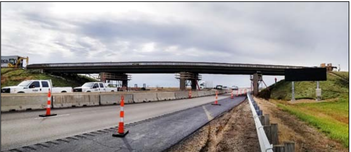
Crews raised the bridge at MM 157 on I-335/KTA to increase the vertical clearance for commercial traffic.