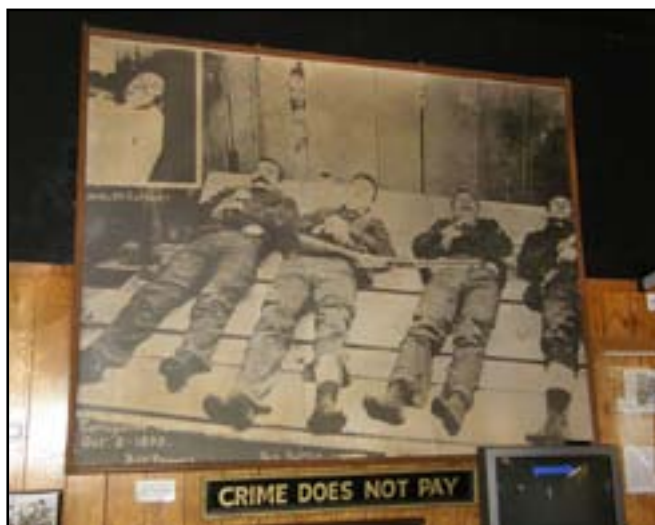
All the Dalton gang members were killed in the battle except Emmett Dalton, who is shown in the upper left corner of the photo.

Visitors can first relive history at the museum at 113 E. 8th Street, and then step outside to tour the Dalton Raid Site at the Old Condon Bank, 807 Walnut, and the Death Alley and Jail in the 800 block of Walnut Street.