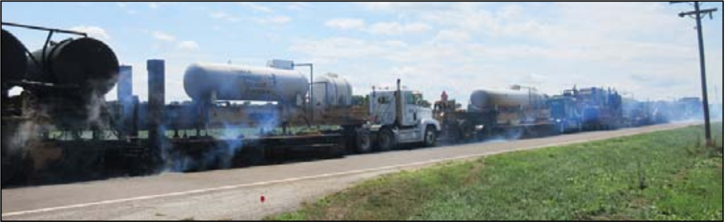
A variety of work is underway in District Two - above, a hot-in-place recycle takes place on K-18 in Ottawa County; below left, the District paint crew stripes K-4 just south of Dwight; and below right, the Clay Center Subarea patches overlays on K-15 north of Clay Center.