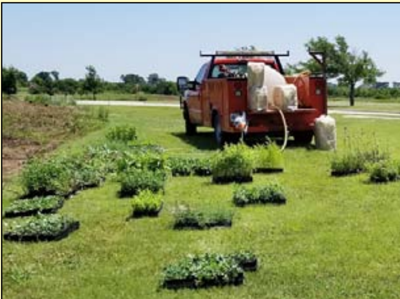
Above, KDOT crews plant 2,000 native wildflower plants at the U.S. 400/U.S. 169 junction in Montgomery County. At right, butterfly lands on a milkweed plant.

Once these wildflowers and milkweed plugs are established, these areas will become havens for monarchs and many other pollinators.