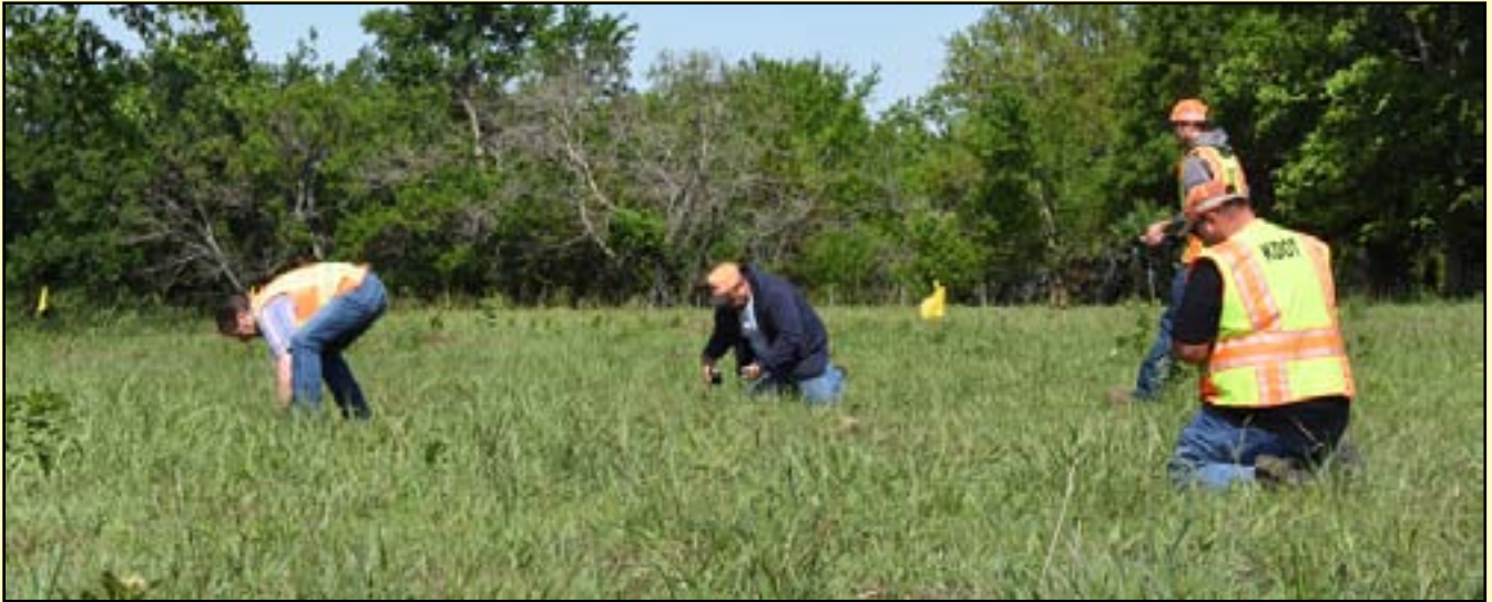
KDOT crews planted 1,196 milkweed plugs at the U.S. 59/I-35 interchange east of Ottawa.

Promoting pollinators: KDOT is buzzing about pollinators lately. National Pollinator Week was June 18-24 and KDOT, along with five other state DOTs and the Federal Highway Administration, signed an agreement that will improve pollinator habitat along I-35, a key migratory corridor for monarch butterflies. Bee and monarch butterfly populations are on the decline. About three-fourths of the world's flowering plants and many of the food crops eaten in North America depend on pollinators. In the U.S., pollination produces nearly $24 billion worth of products annually. The lack of pollination would mean no apples, blueberries, almonds, melons, pumpkins, chocolate, coffee and more. Last year, KDOT's Environmental Services unit, along with KDOT crews from the Ottawa Subarea, planted