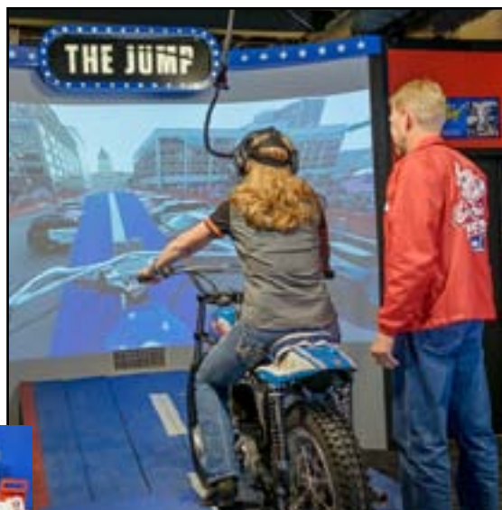
As shown in the photos, the Evel Knievel Museum in Topeka has lots of memorabilia and an interactive game where riders can experience a jump.