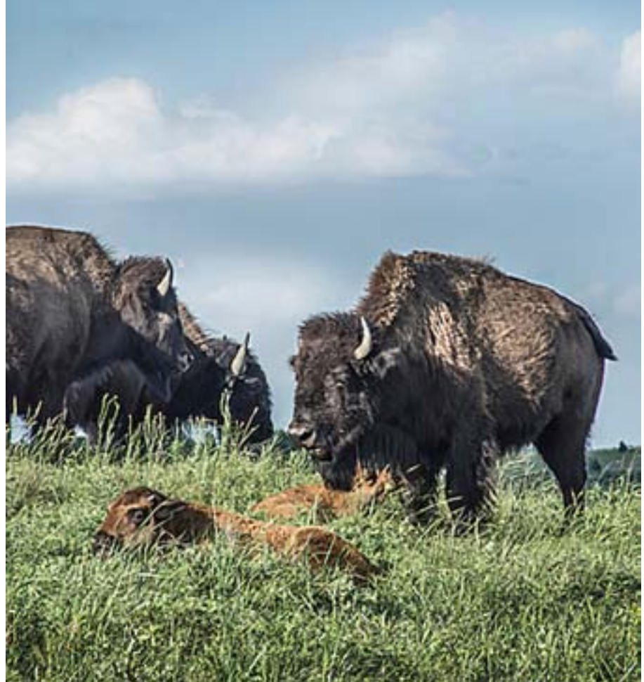
Numerous buffalo can be seen at the Maxwell Wildlife Refuge.

Numerous buffalo can be seen at the Maxwell Wildlife Refuge. In Battlehill township of McPherson County lies a piece of preserved natural prairie, comprised of rolling hills, creeks, springs and beautiful prairie grasses and wildflowers. Maxwell Wildlife Refuge near Canton is home to one of the few surviving wild buffalo herds. It began in 1859, when a small herd of buffalo were driven into the area around the Maxwell homestead. The Maxwell family wanted to preserve a piece of prairie with a roaming herd of buffalo for future generations. So in 1943, the Henry Maxwell estate donated 2,560 acres of land to what is now the Kansas Department of Wildlife, Parks and Tourism for the creation of the Maxwell Wildlife Refuge, which is dedicated to bison and other species. This unique area, located six miles north of Canton, possesses one of the finest herds of buffalo in the United States, along with elk and other wild game.