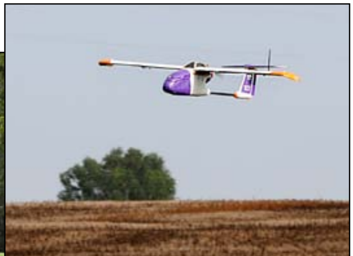
At left, Kansas State University Polytechnic staff get ready to launch the UAS at the event. Above, the UAS travels close to the ground.