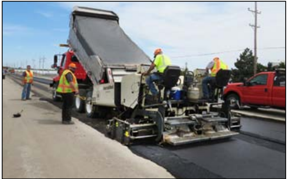
Above, U.S. 50 median removal takes place in Garden City. Below, Edge ruts are filled on K-25 north of Lakin. At the bottom, resurfacing work took place on U.S. 283.

While Lakin was resurfacing on K-25, the Jetmore, Dodge City and Ness City crews teamed up to resurface