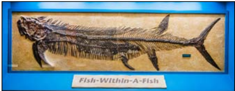
Above, one of the most famous fossils at the Sternberg Museum in Hays. In the photos below, many of the displays at the museum are realistic examples of life millions of years ago.

In addition to its permanent displays, the Sternberg also hosts temporary exhibits and various events