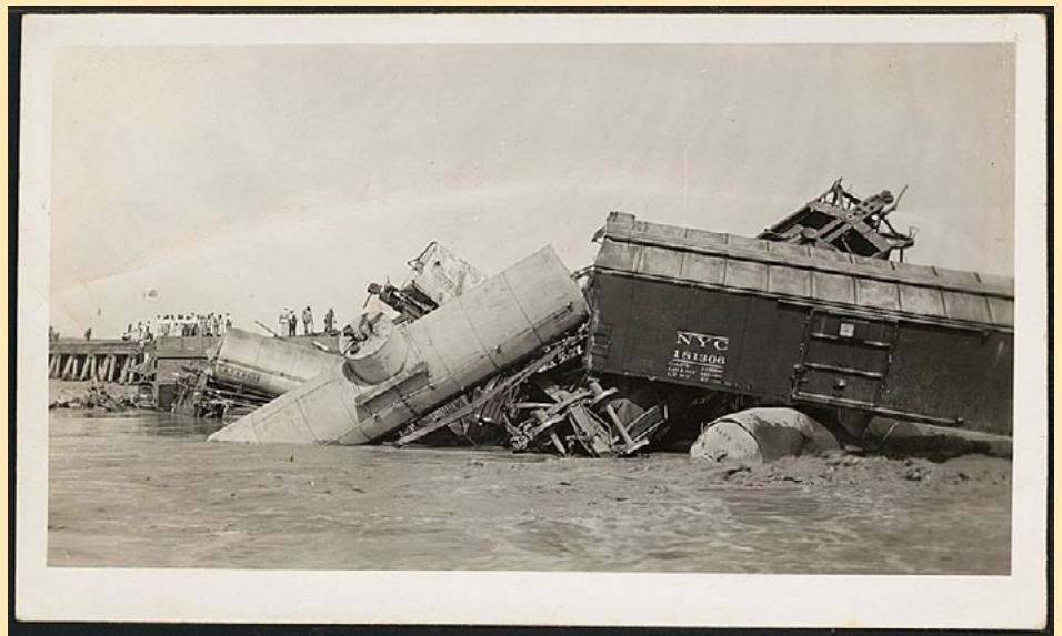
Floods washed out bridges in 1937 and the Gold Ball freight train attempted to cross the river but fell into the waters killing two and injuring four men. Thirty train cars sank to the bottom of the river.

In late September 1938, work began on the new bridge. Over the next 10 months, crews moved five million cubic yards of earth to build the approaches for the new crossing. Caisson-sunk concrete piers, built in the art deco style of the period, were placed on