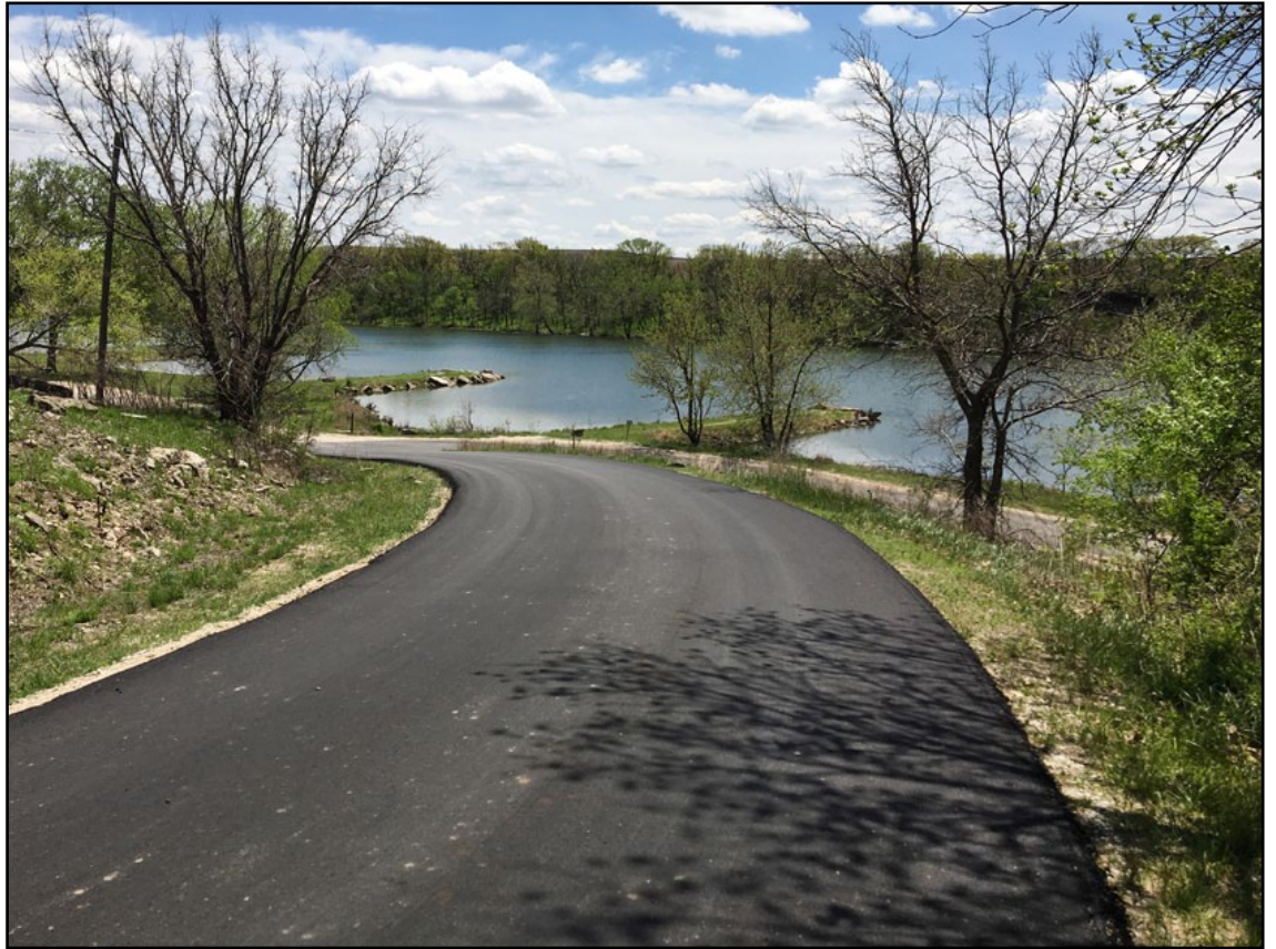
KDOT employee Nick Squires took this photo of the finished asphalt overlay project around Cowley State Fishing Lake.

The 84-acre Cowley State Fishing Lake is east of Arkansas City immediately adjacent to U.S. 166. The lake is home to bluegill, channel catfish, largemouth bass and redear sunfish.