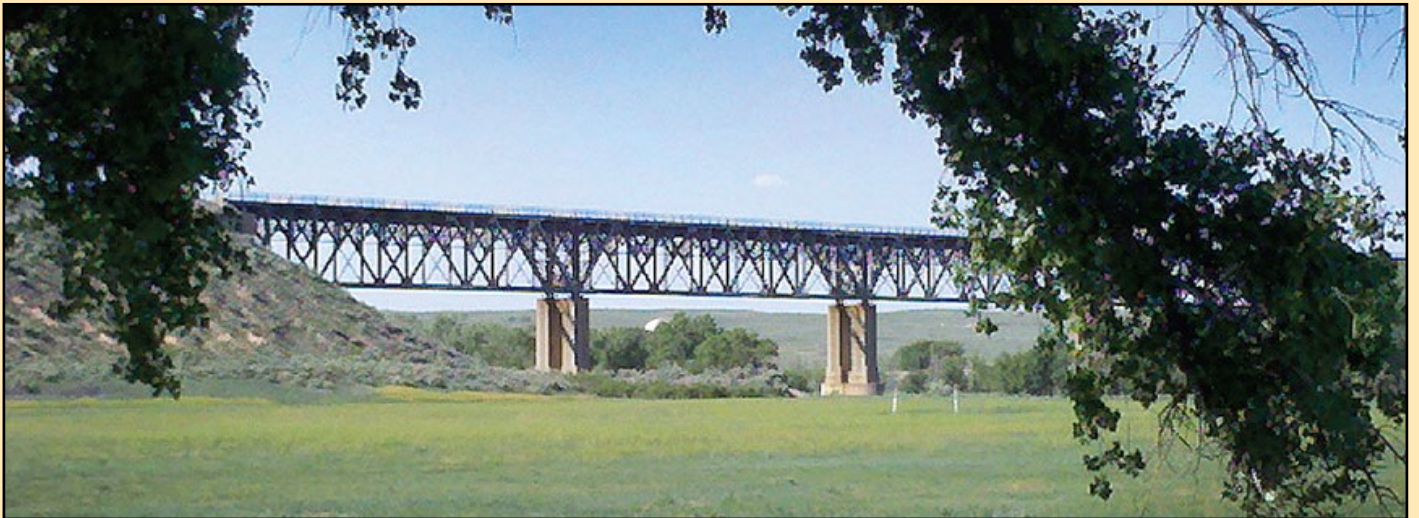
The Sampson of the Cimarron is a bridge that stands tall in Seward County.

A look back in time: Built in 1888, the Rock Island Railway put Seward County and Liberal on the map. The railroad stretched over the plains, providing Kansas with a gateway to the rest of the world and transporting goods in and out of southwest Kansas. In stark contrast to the drought ridden plains and dry river beds common in southwest Kansas today, the Cimarron River, located between Kismet and Liberal, presented a problem for the railroad when it was built. The sand-choked, low lying creek was prone to flooding during heavy rainfalls. The initial crossing was built near the town of Arkalon, where trains slowed to 30 mph to navigate the 3.5 miles of curves and trestles crossing the river.