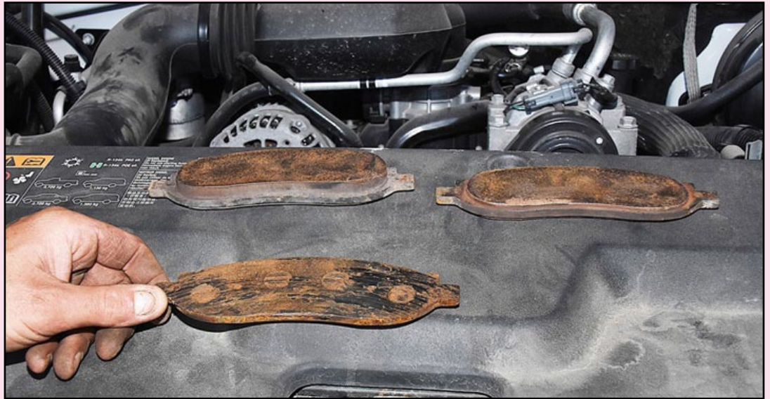
Brake pads at various stages of wear are displayed.

According to AAA, depending on the vehicle, the disc brakes are located in the front and back of the vehicle. The disc brakes consist of disc pads, rotors and calipers. Consider which part of the brake needs repair. Brake wear can be indicated by sounds of squealing, chirping or scraping. Brake wear may also be indicated by shaking, which is a sign of bad rotors. According to some mechanics, if brake pads wear out, the metal backs on the brake pad will start to rub against the brake rotor. This connection can be damaging to the rotor and endangers motorists. To