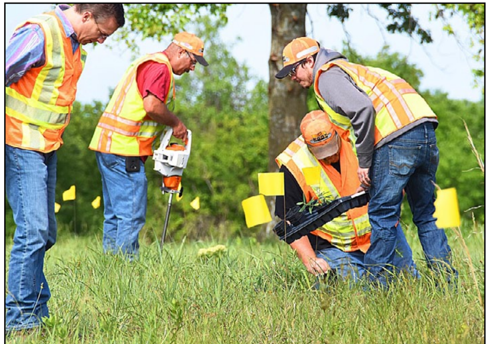
KDOT crews planted 1,152 milkweed plugs near the Homewood rest area along I-35 to create more pollinator habitat.

According to KDOT employees from the Ottawa office, the wildflowers and milkweed plugs are doing very well and a few plants are in bloom this year. To learn more about helping to save pollinators and what kind of flowers typically grow along Kansas highways, go to http://pollinatorweek.ksdot.org .