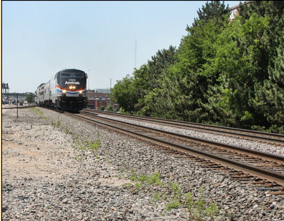
The Amtrak Inspection Train as it arrived in Wichita on June 9.

Amtrak Heartland Flyer, which is sponsored by the Oklahoma and Texas DOT and makes connections to the Amtrak Texas Eagle and Sunset Limited trains in Fort Worth and San Antonio. A proposed extension would enable train-to-train connections in Newton with the Amtrak Southwest Chief which provides service