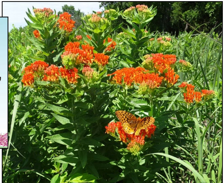
A butterfly rests on a butterfly milkweed plant at the Homewood rest area.

June 19-25 is Pollinator Week and KDOT, along with five other state DOTs and the Federal Highway Administration, signed an agreement that will improve pollinator habitat along I-35, a key migratory corridor for Monarch butterflies.