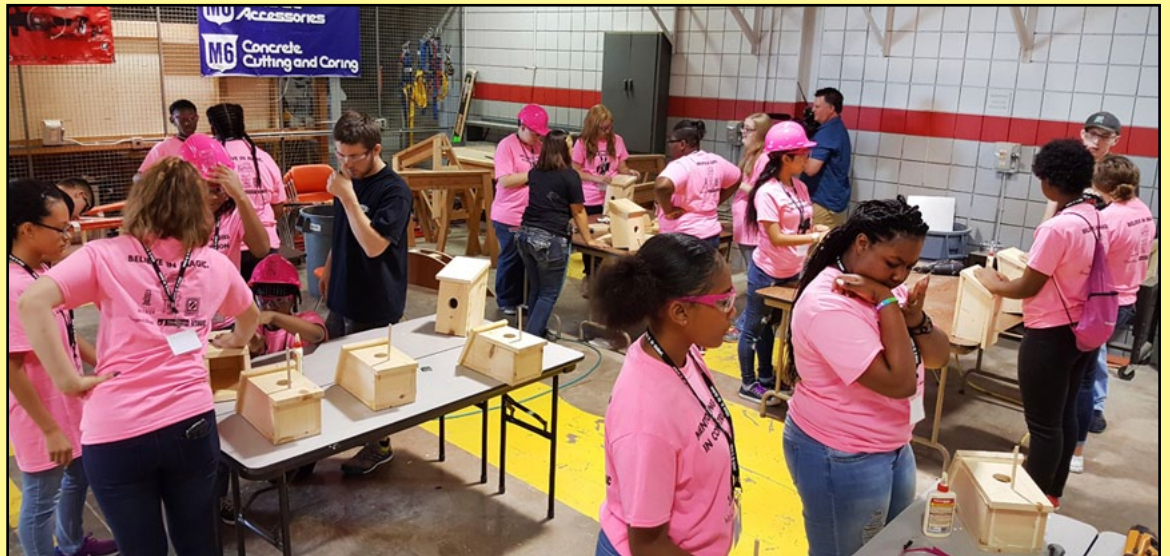
MAGIC camp participants in Wichita learn some basic construction techniques while building birdhouses during one of the tours.

age 14 or older to trade skill occupations such as carpentry, safety, electrical and highway construction and gives them a chance to learn from women already succeeding in these jobs. This week's event is sponsored by the City of Wichita and KDOT. Students will visit places such as Wichita Dwight