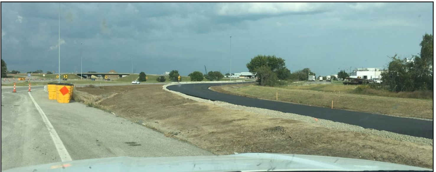
KTA crews lay the new ramp to the east Topeka toll at Plaza 177.