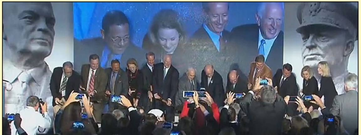
A ground-breaking ceremony took place Nov. 2 in Washington, D.C., for the Eisenhower Memorial. The memorial is expected to open in 2020.

"Kansas will be represented in Washington, D.C.,"