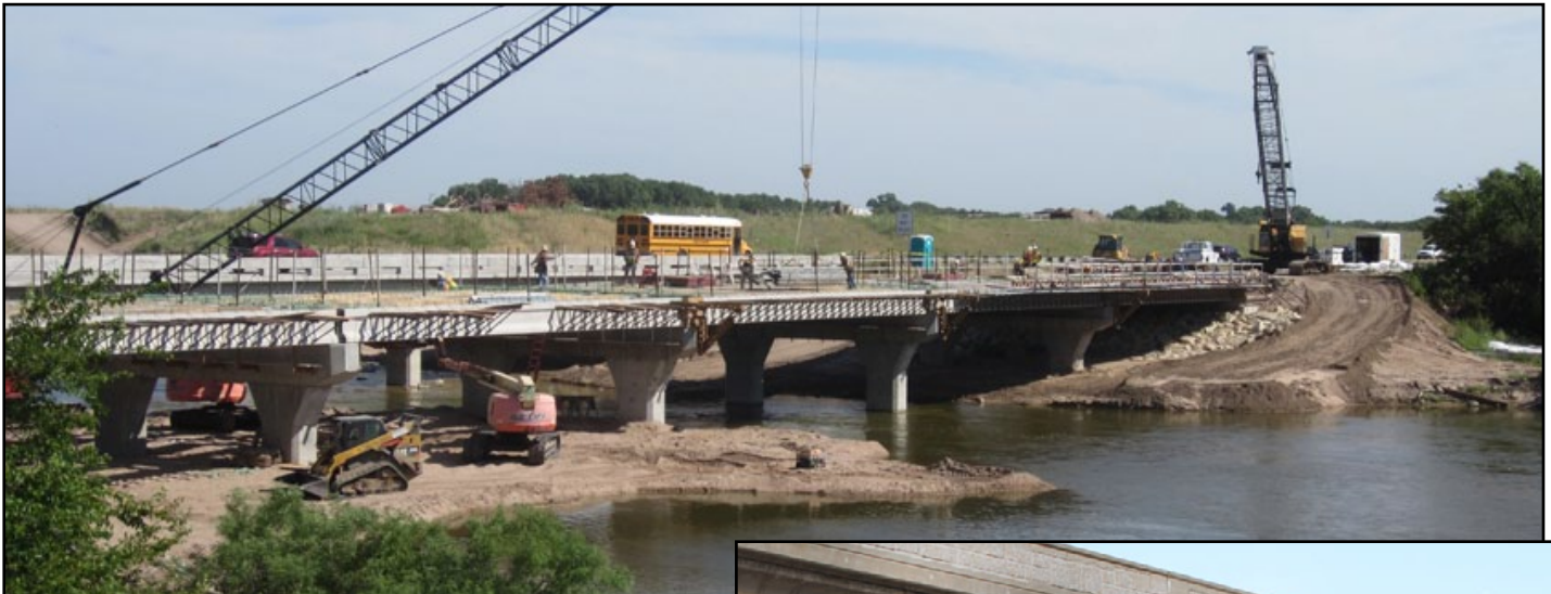
Above, the northbound side of the Big Ark River bridge was constructed this year. At right, the new 25th Street bridge has the stamped concrete “decoration.”

I-235 wraps up: After two construction seasons, five bridges on I-235 in northwest Wichita were replaced and traffic returned to normal in late October. In 2016, the southbound I-235 bridges over the Wichita – Valley Center Floodway and the Big Arkansas River were replaced. This year, the northbound bridges were built plus the 25th Street bridge over the interstate.