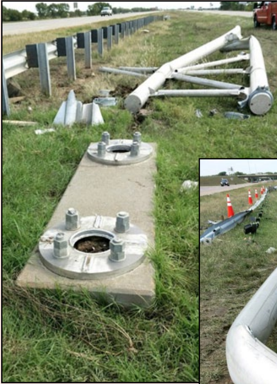
Above and right, the support column for the overhead sign on I-70 near the I-135 junction was destroyed in a crash on Sept. 28. Below, work takes place to replace the columns and install the sign.

Quick repairs: A semi-truck taking the northbound I-135 ramp to eastbound I-70 rolled and hit the overhead sign truss on Sept. 28. The crash closed all lanes of traffic on I-70. The Salina Subarea crew was at the scene controlling traffic from 8 p.m. until 5 a.m. The truss itself was undamaged and was set on the ground by the Subarea crew with the help of a tow truck driver. However, the south support column was destroyed along with the guardrail (which has been replaced by the Salina Subarea crew.)