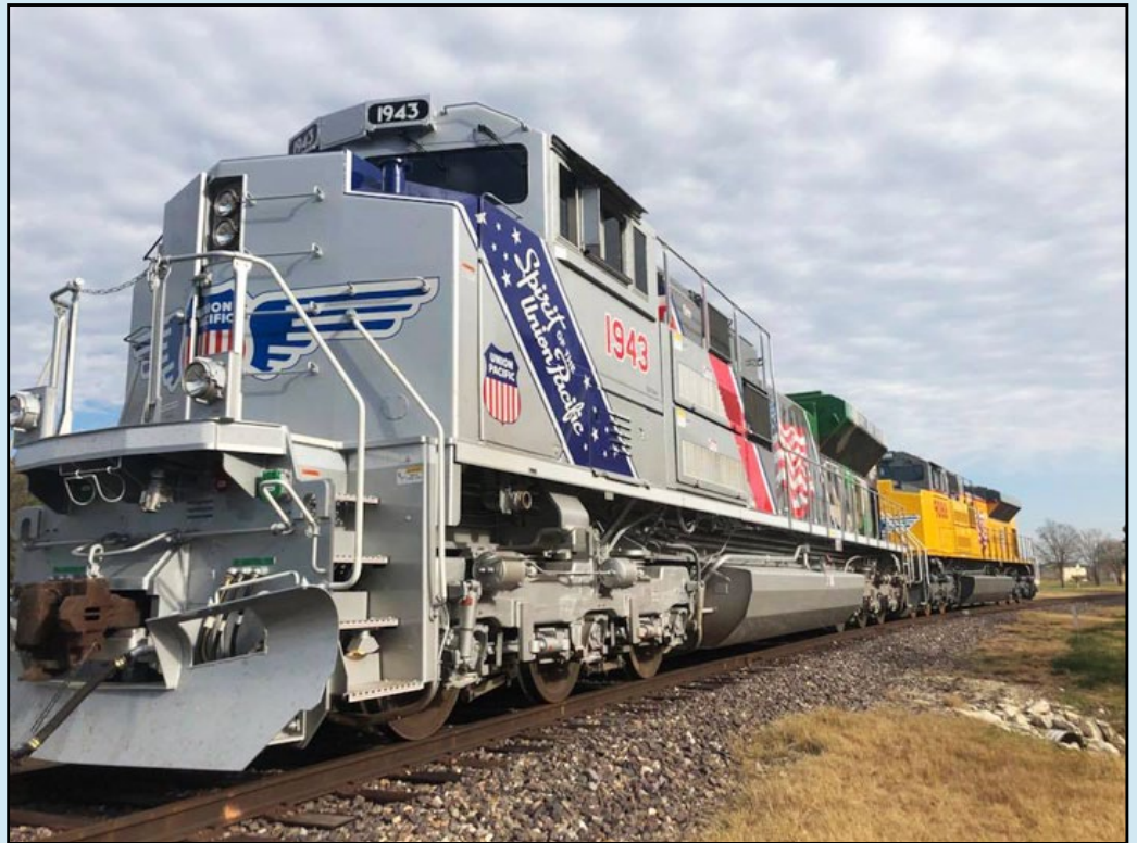
The Spirit, or locomotive No. 1943, was unveiled at a ceremony at Fort Riley on Nov. 6. The locomotive was painted specifically to honor all branches of the Armed Forces.

With 2,196 miles of track in Kansas, and a capital investment of more than $75 million, as well as state and community support, Union Pacific remains an integral part of life in Kansas. Union Pacific operates a transcontinental corridor through the northeastern corner of the state and a north-south "couplet" of main lines from Kansas City to the Gulf Coast.