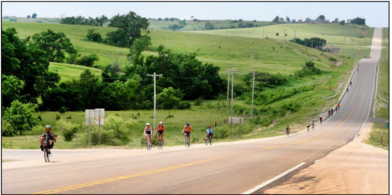
Participants in last year's Biking Across Kansas are shown above.

Participants range in age from nine to 90 years old and represent multi-generational families. Many riders will be from Kansas, but entries will also represent 30 states, including Vermont, Pennsylvania, Florida, Arizona,