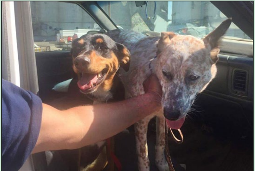
Trin and Jay, two dogs that went missing after their owners were in a crash, were found with the help of KDOT employees.