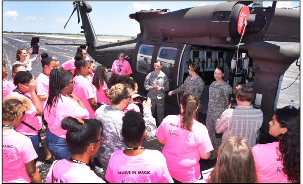
Members of the 108th Aviation Regiment speak to the students participating in the MAGIC camp at Forbes Field on Monday while learning about various areas of aviation.