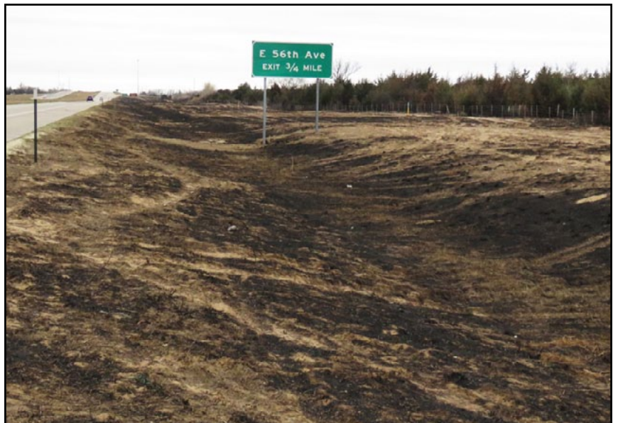
Right of way burned in Reno County.