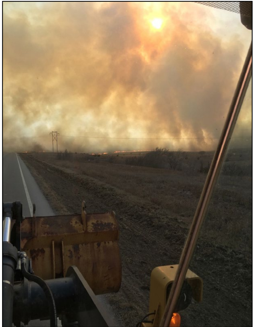
Fires burn near U.S. 183 south of Stockton.