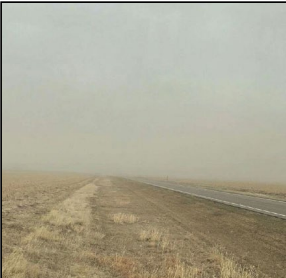
Smoke blows across U.S. in Cheyenne County.