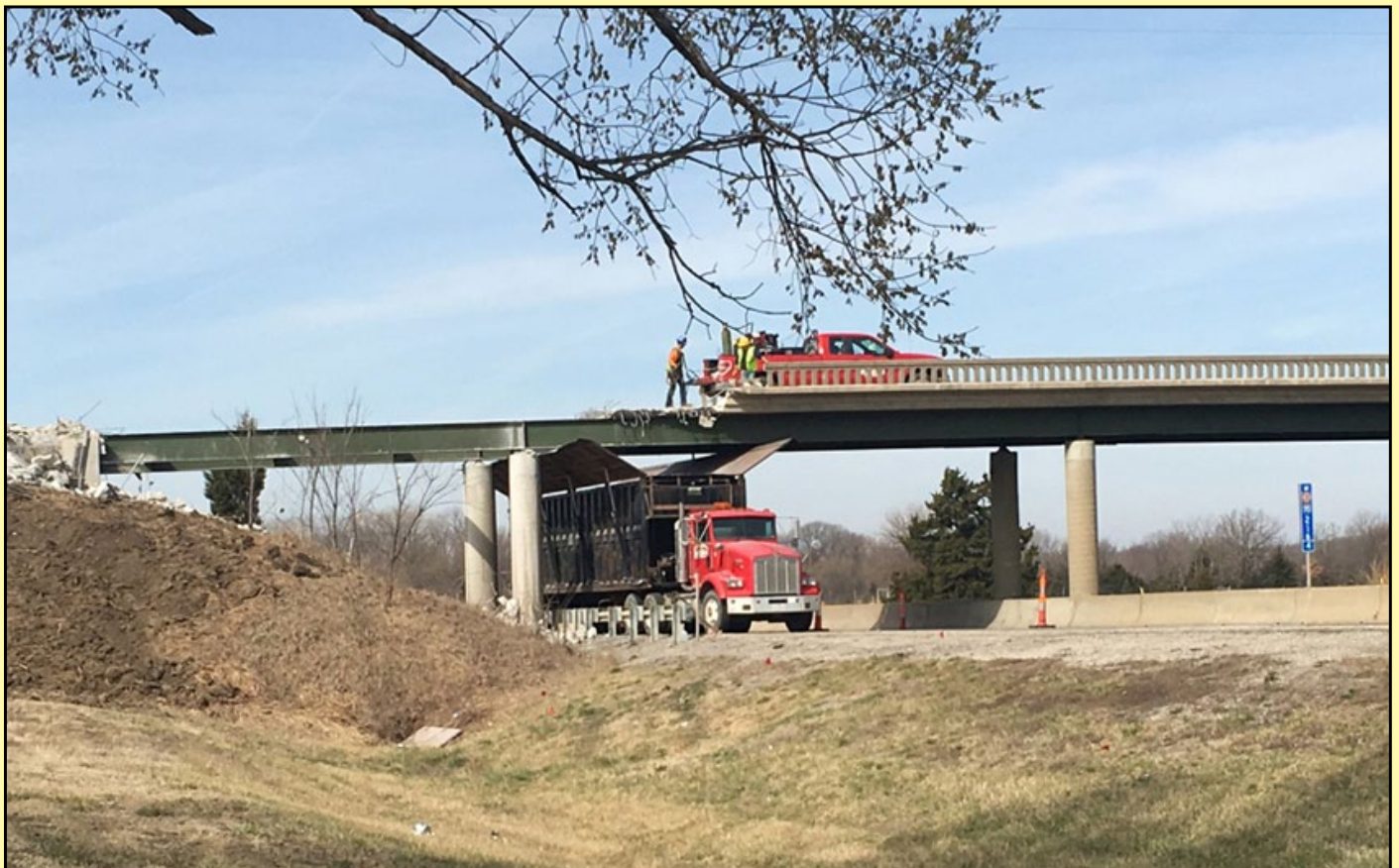
Demolition has started at the 188th bridge near Eastern Terminal along the Kansas Turnpike.