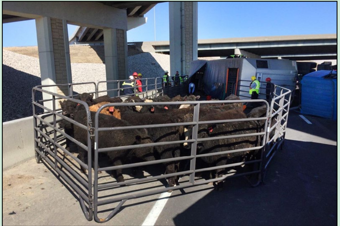
Loose cattle are rounded up on I-435 after a semi overturned on March 3.