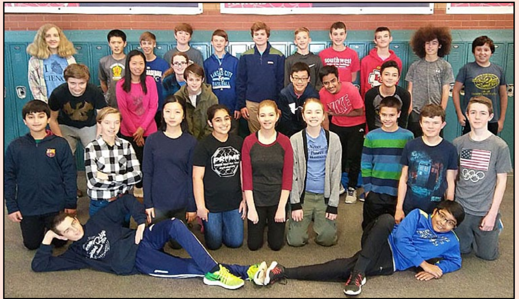
Teratai team photo from the Great Plains regional competition that took place in January in Manhattan.

As part of Southwest's fifth-place win, the school's team will receive $750 from Ohio University and the National Council of Examiners for Engineering and Surveying. The students also nabbed a special award, "Protecting the Public's Safety and Welfare Through Competent and Ethical Engineering Practices," which comes with a $300 check from the National Society of