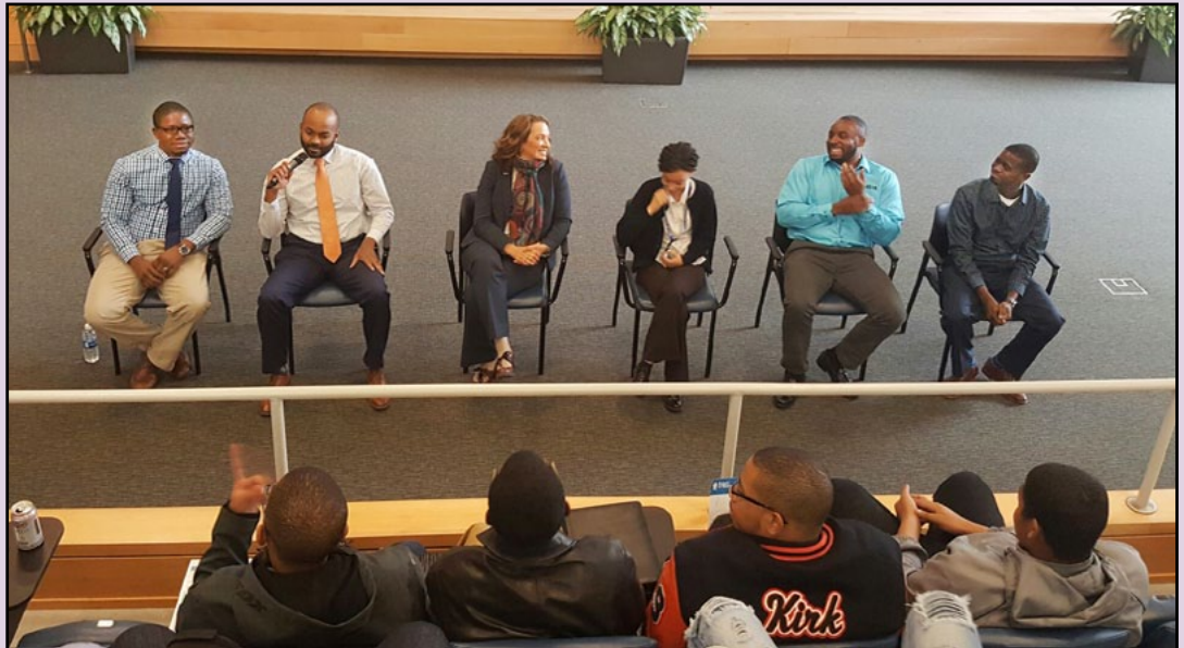
Engineers in various transportation careers answer questions from students participating in the Garrett A. Morgan Shadow Day.

High school students interested in transportation from the metro area are given a chance to learn about the different facets of local transportation as well as the careers involved. This year's tours included stops at the Kansas City Area Transportation Authority, the KC Streetcar – RideKC headquarters, a tour of the Charles B. Wheeler Airport and an engineering panel session at Burns & McDonnell.