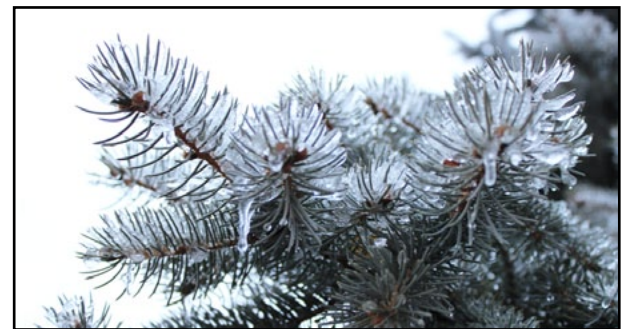
Ice can be seen on U.S. 36 west of Phillipsburg on Jan. 16 at left and on the tree above. During that storm, the Hays and Great Bend areas got nearly an inch of ice and the Dodge City and Liberal areas got at least one inch of ice.