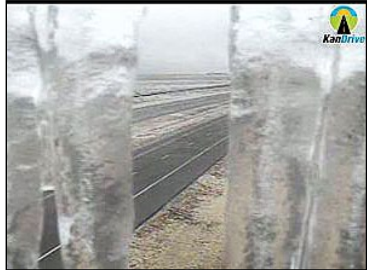
The image from the camera on U.S. 54 west of Liberal on Jan. 15 illustrates the weather conditions many people around the Midwest dealt with for several days.