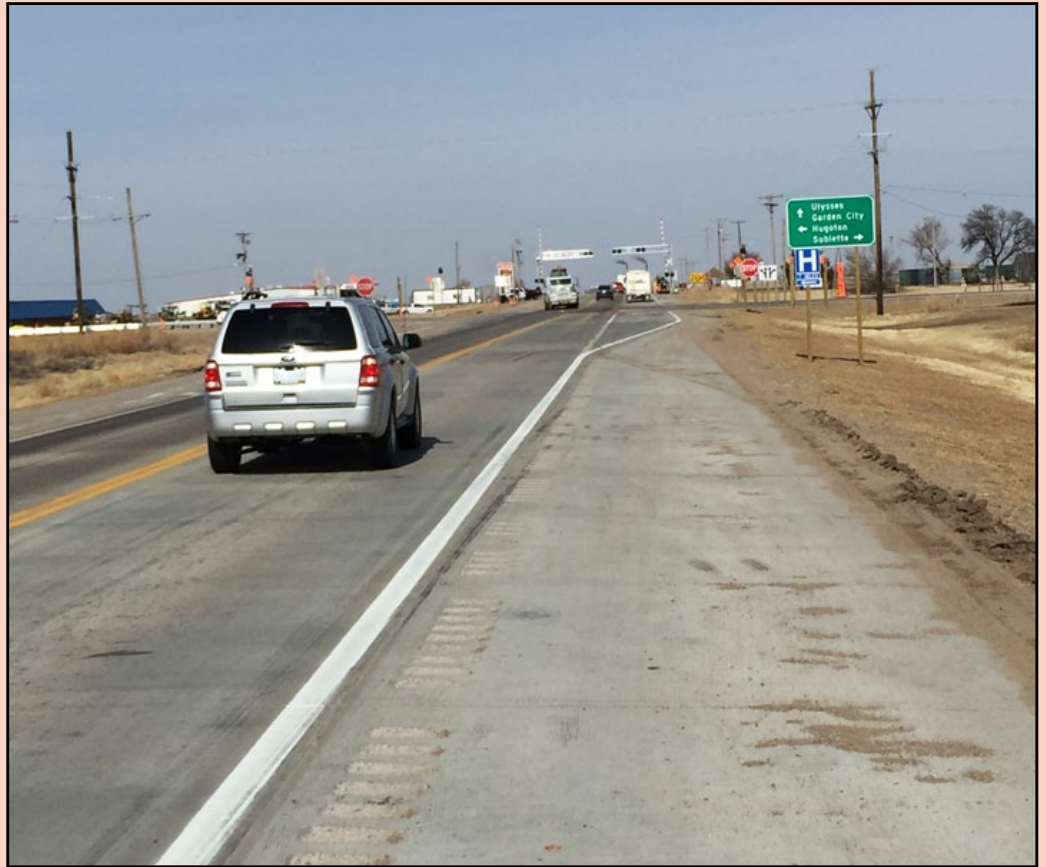
Traffic drives through the upgraded U.S. 56/U.S. 83 intersection.