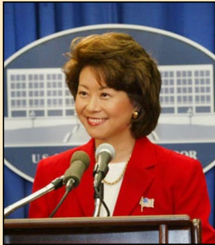
U.S. Transportation Secretary Elaine Chao

"It is an honor to rejoin the extraordinary people of the U.S. Department of Transportation, and begin working with them to rebuild, refurbish and revitalize America's infrastructure," Chao says. "My goal has always been to help others access opportunity and build better lives for themselves and their families by supporting policies that foster job creation and workforce competitiveness. At this crucial time, the Department of Transportation can make a tremendous difference for our country." During her nomination hearing before the Senate Committee on Commerce, Science and Transportation, Chao emphasized the need for sustained funding for transportation projects, with the potential for using public-private partnerships as an ingredient in a mix of financial methodologies.