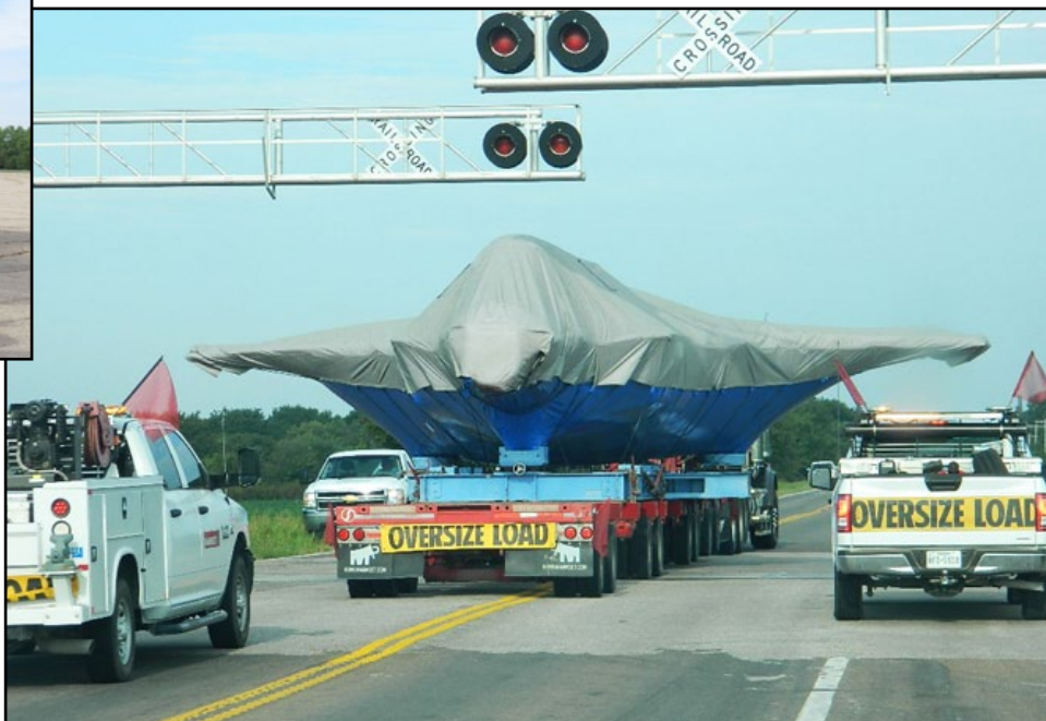
The F-35 production aircraft made its way through Wichita the morning of Aug. 21.