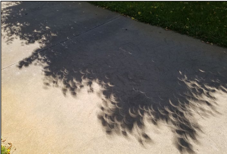
Leaves on trees in Norton made crescent shapes on the concrete.

Eclipse views - one from Norton, above, and three from Atchison, below. To see a video of the eclipse in Atchison, click here .