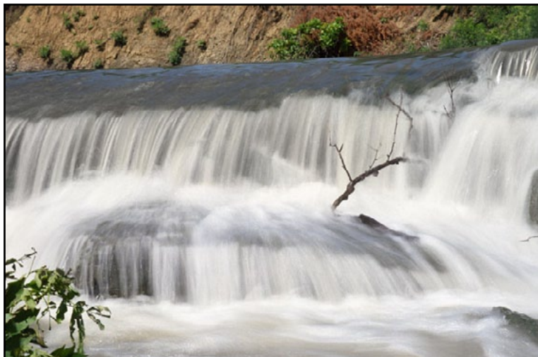
The waterfall at Pillsbury Crossing.

The source of this waterfall is from the Cottonwood