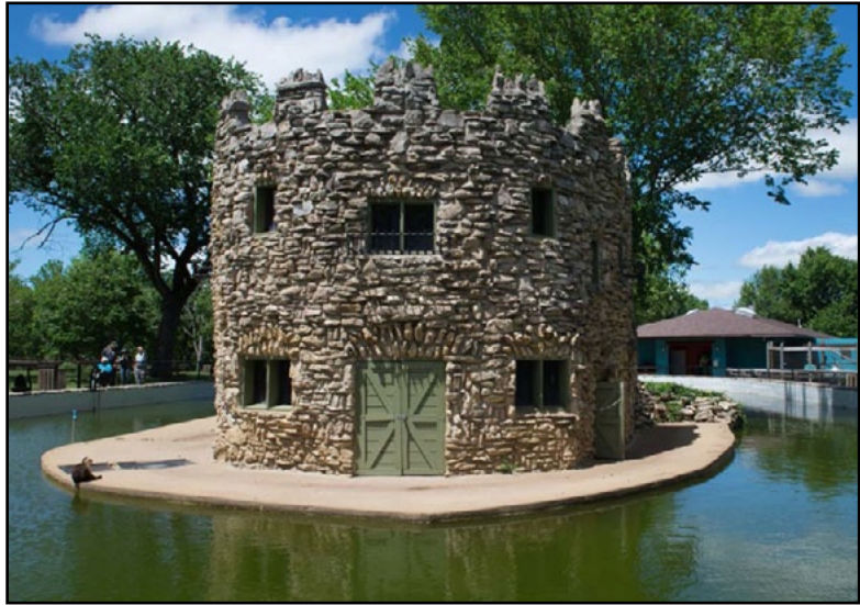
Monkey Island at the Ralph Mitchell Zoo in Independence.