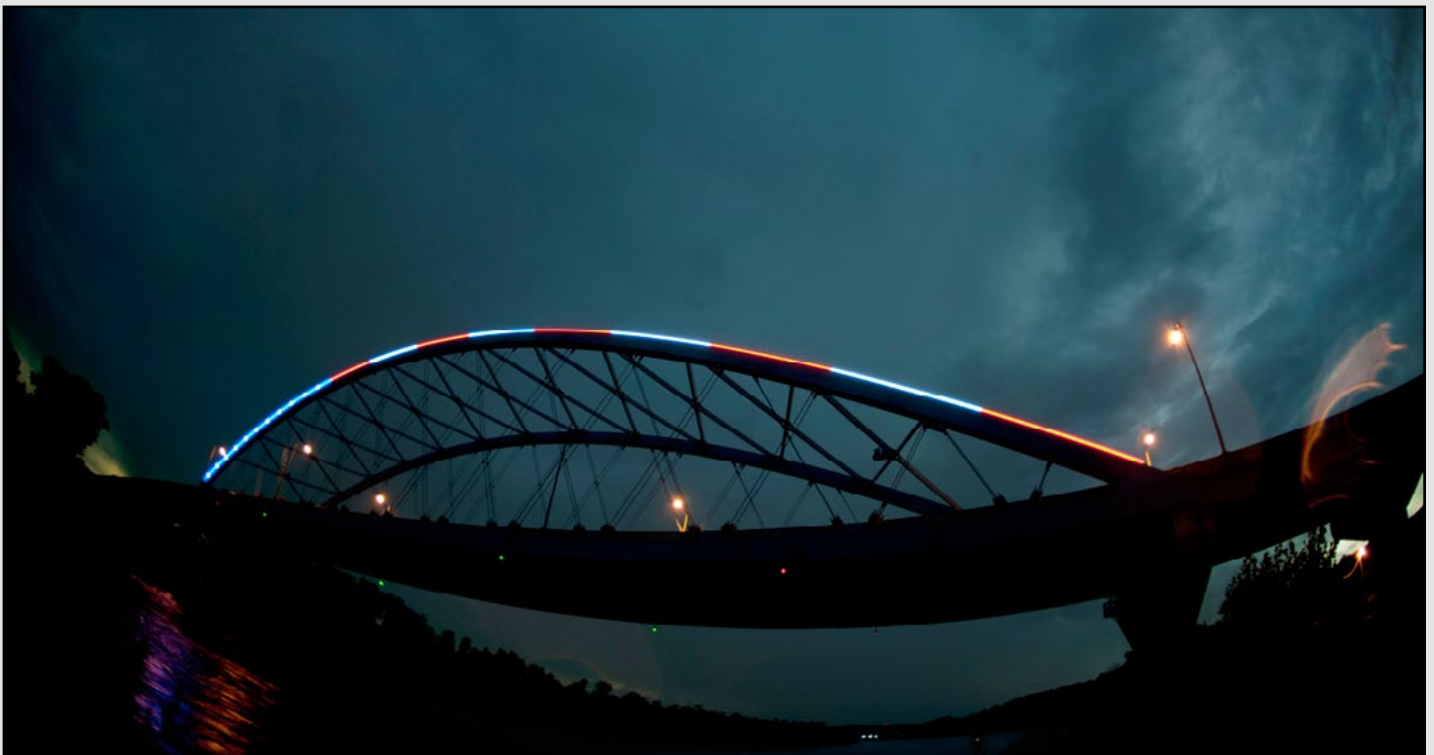
The Amelia Earhart Memorial Bridge in Atchison was lit up during the eclipse on Monday.