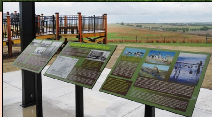
Above and at left, views from the new scenic overlook.