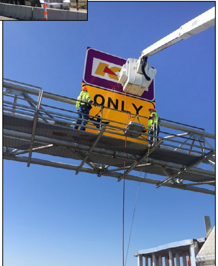
New purple K-TAG signs were recently installed overhead at Southern Terminal, I-35/KTA. Purple indicates lanes restricted to vehicles with registered electronic transponders compatible with the tolling system.