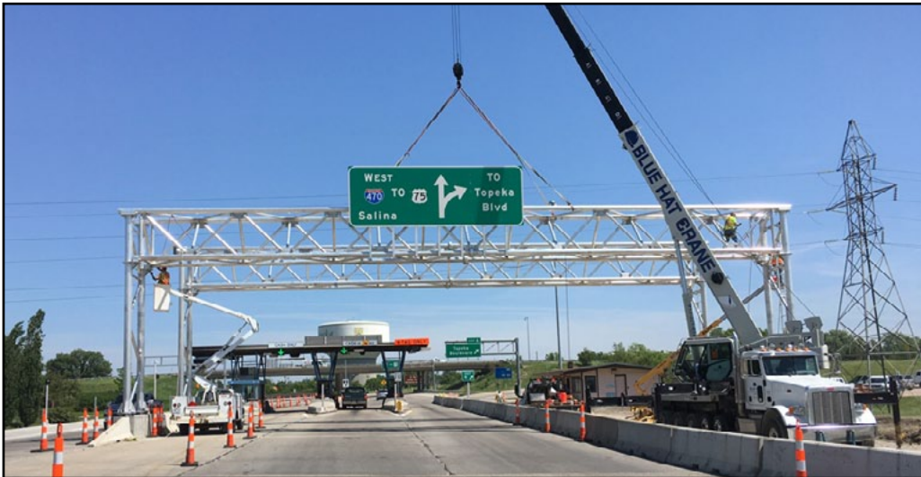
New overhead trusses were recently installed at the South Topeka toll plaza. The signs along with toll booth and lane improvements are part of the construction project.