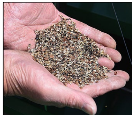
Once the seeds shown at left are planted, they help attract pollinators, like the butterfly above, which are critical to the ecosystem.

or have disappeared from parts of their range because of habitat loss. It is imperative to protect our natural environment to ensure the success of pollinators."