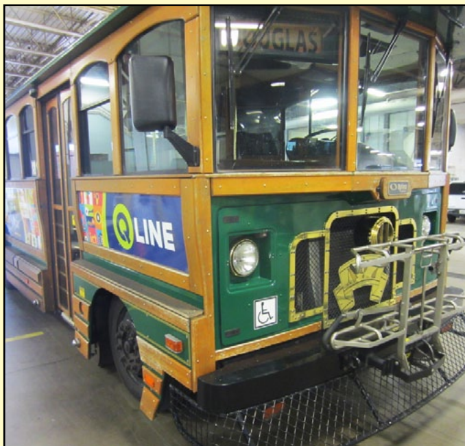
Q-Line trolleys services have been expanded in the Wichita area.

Q-Line improved: Wichita Transit launched an improved Q-Line service on May 13, providing more routes, operating more hours and running more frequently in downtown and surrounding areas. The Q-Line trolleys are free, and the routes have also been expanded. The Q service now offers two evening and weekend routes and two weekday lunch routes, connecting downtown and Old Town with Delano Douglas Design District and College Hill. There will be an Old Town Route, a Douglas Route, a Delano/Old Town Route, and a Government Center Route. The Q will add two lunch routes from 11 a.m. to 1:30 p.m. Monday through Friday. The Government Center Route will connect riders from Main and Central to Old Town via Douglas, and the Delano/Old Town Route will connect riders from Delano to Old Town along Douglas. Trolleys will run every 10 minutes. The new, expanded service is made possible through a public-private partnership between Wichita Transit, Wichita Downtown Development Corp., and other downtown businesses. The Q is an important asset to downtown, providing easy-to-use frequent transportation for residents, visitors and eventgoers. Route and schedule information is available at www.wichitatransit.org/qline .