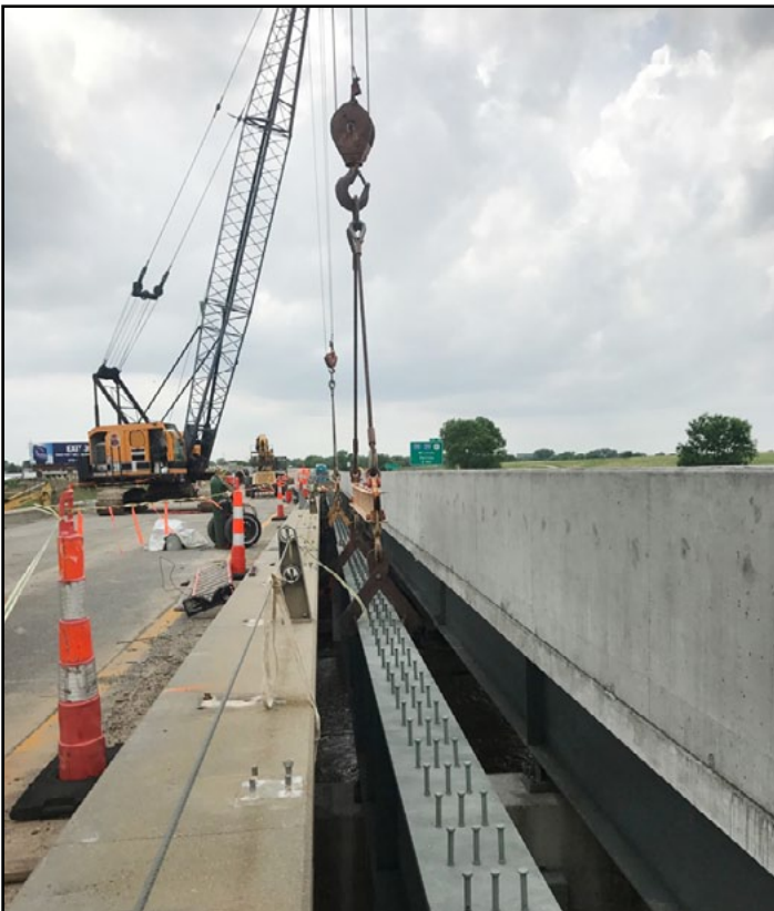
Steel girders were set on the northbound side of the Arkansas River bridge in south Wichita (I-35/KTA MM 45) as part of the current bridge reconstruction and widening project.