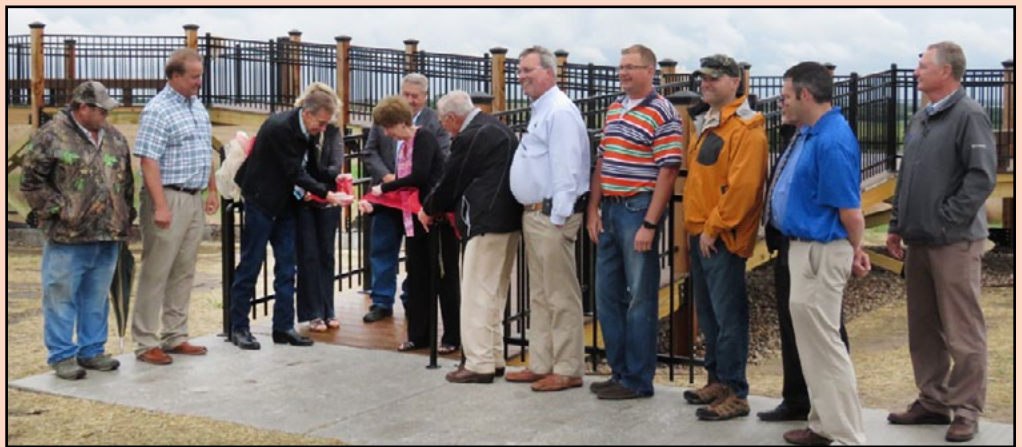
Attendees cut the ribbon at the new scenic overlook in Barton County.