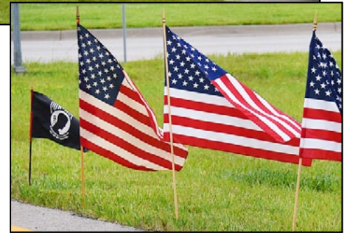
Above, flags were placed along part of the grounds of the service area to show support for the riders, as seen below.