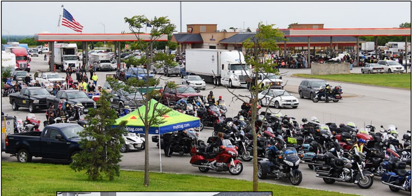
Above and right, Run for the Wall motorcycle riders get gas and line up at the KTA Service Area east of Topeka on the morning of May 22.