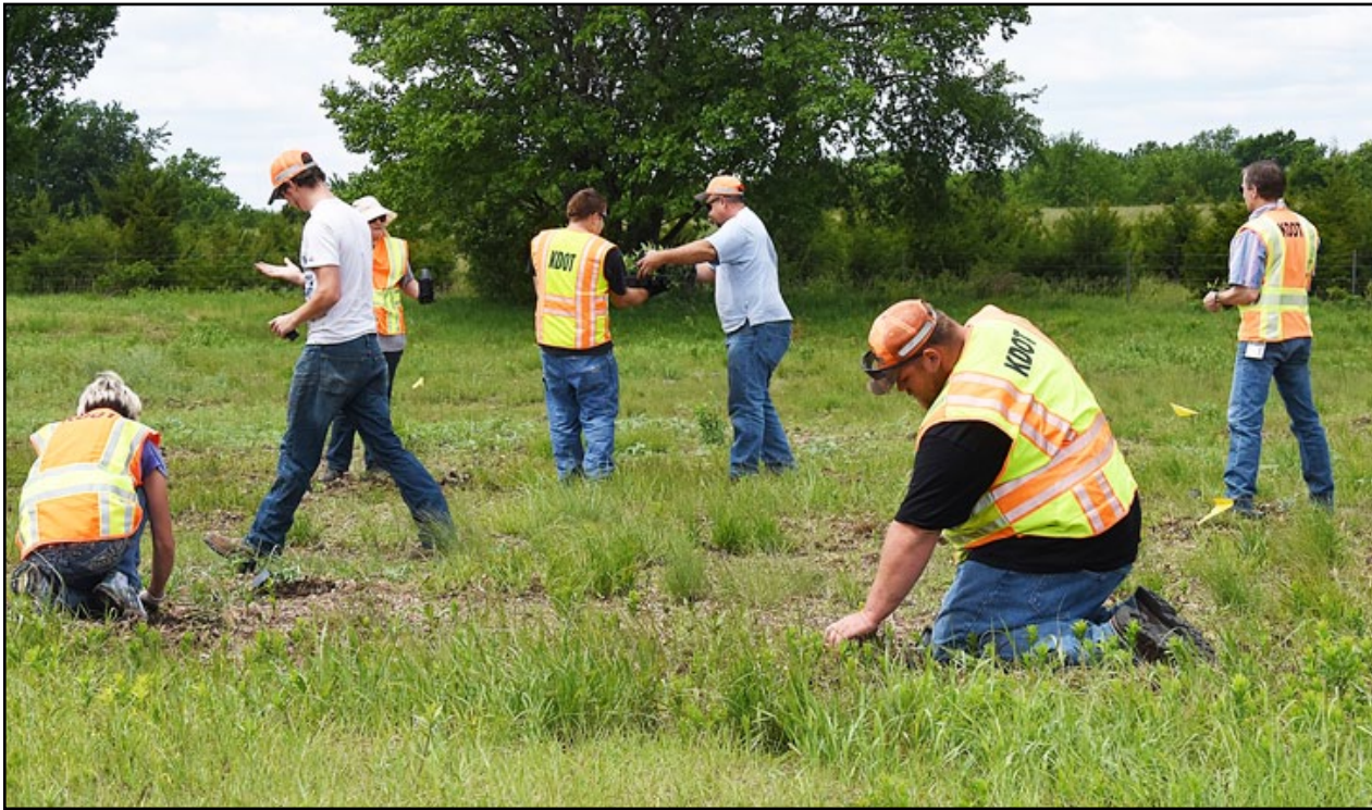
KDOT staff plant wildflower seed and milkweed plugs along I-35 around the safety rest areas near Ottawa.