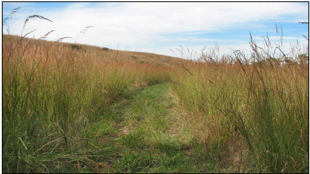
The Tallgrass Prairie National Preserve covers 11,000 acres; most is in the Flint Hills.

If you're not looking for a hike but want to view the prairie's history, the prairie also offers guided bus tours, free of charge. The tours must be scheduled in advance, are 60-90 minutes long, and run until October, weather and staffing available.