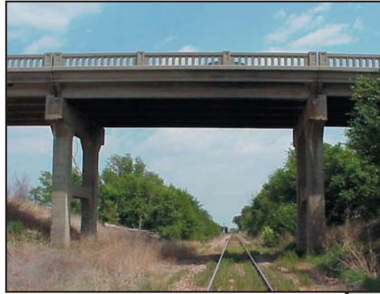
This K-25 bridge over the railroad tracks in Colby will be removed this summer.

Another interesting project in District Three is in Colby. A bridge about six blocks north of US-24 on K-25 that carries traffic over a rail track will be removed and replaced with an at-grade crossing. Work will begin early this summer.