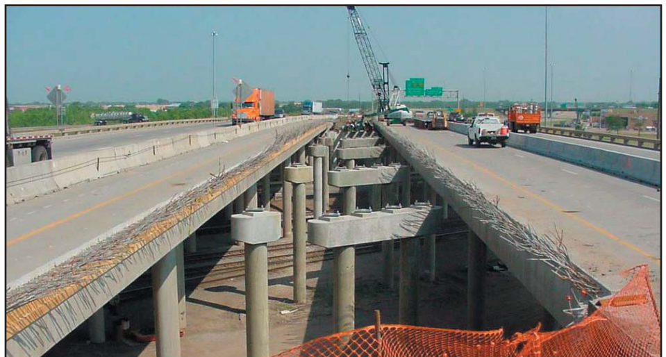
I-135 bridge widening in Wichita will continue this year.

I-135 will also have another reconstruction project beginning this year starting north of Newton and continuing to the Harvey/McPherson county line near Hesston. This project offered contractors the option of bidding the project to be completed in two years or one year. Interstate Highway, the prime contractor, bid $16.9 million to complete the 7.4-mile project in one year. One important public involvement aspect of this project is that the contractor will keep the interchange at Hesston open during construction, to reduce inconvenience to that community.