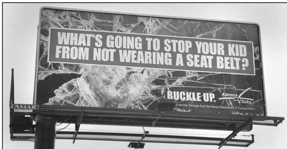
A billboard in Topeka encourages parents to ensure child passengers use safety belts.

The distinctive KDOT billboards are located in 16 counties and feature a text box containing white letters against a red background. Text boxes in some cases