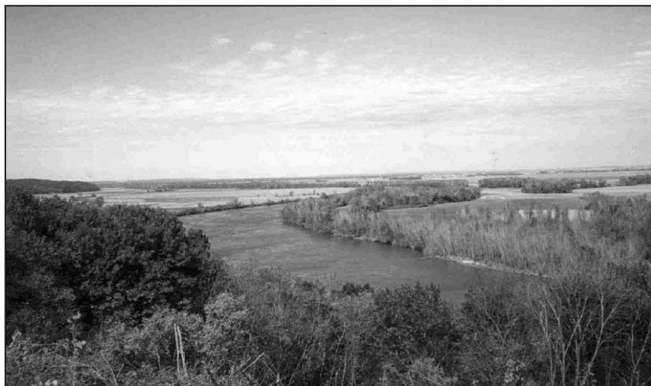
Lots of unique scenery can be found along the Glacial Hills Scenic Byway in northeast Kansas. This is the fifth route named as a Scenic Byway.

Survivors include a son, four grandchildren and eight great-children. Memorial contributions may be made to Westminster Presbyterian Church, 1275 S.W. Boswell Ave., Topeka, 66604 or to Brewster Place Retirement Home, 1205 S.W. 29 th , Topeka, 66611.