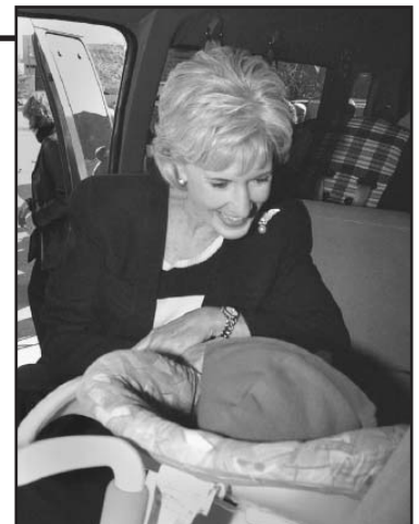
Governor Sebelius checks to see that an infant is properly secured during the event.