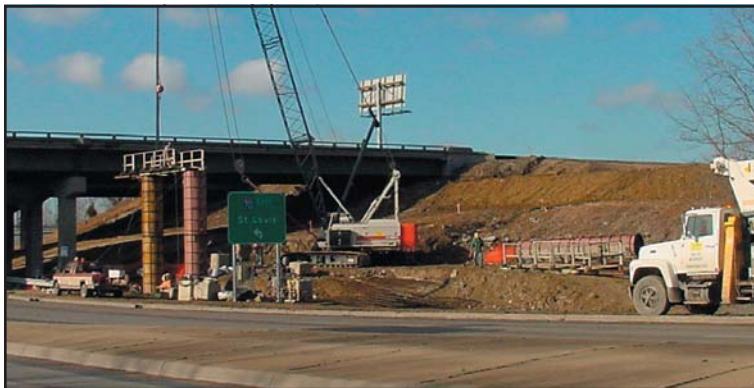
This bridge work is part of the project on I-635.

The project to repair I-70 west from the Shawnee/Wabaunsee county line to the Maple Hill exit will cost $17.6 million. The project for the repair of I-70 east from the Shawnee/Wabaunsee