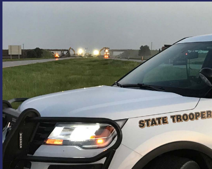
The Avenue A bridge, located south of U.S. 56, was demolished on July 17.

On July 17, the Avenue A bridge, located south of U.S. 56 in McPherson County, was demolished and removed so new construction can begin to replace the bridge.