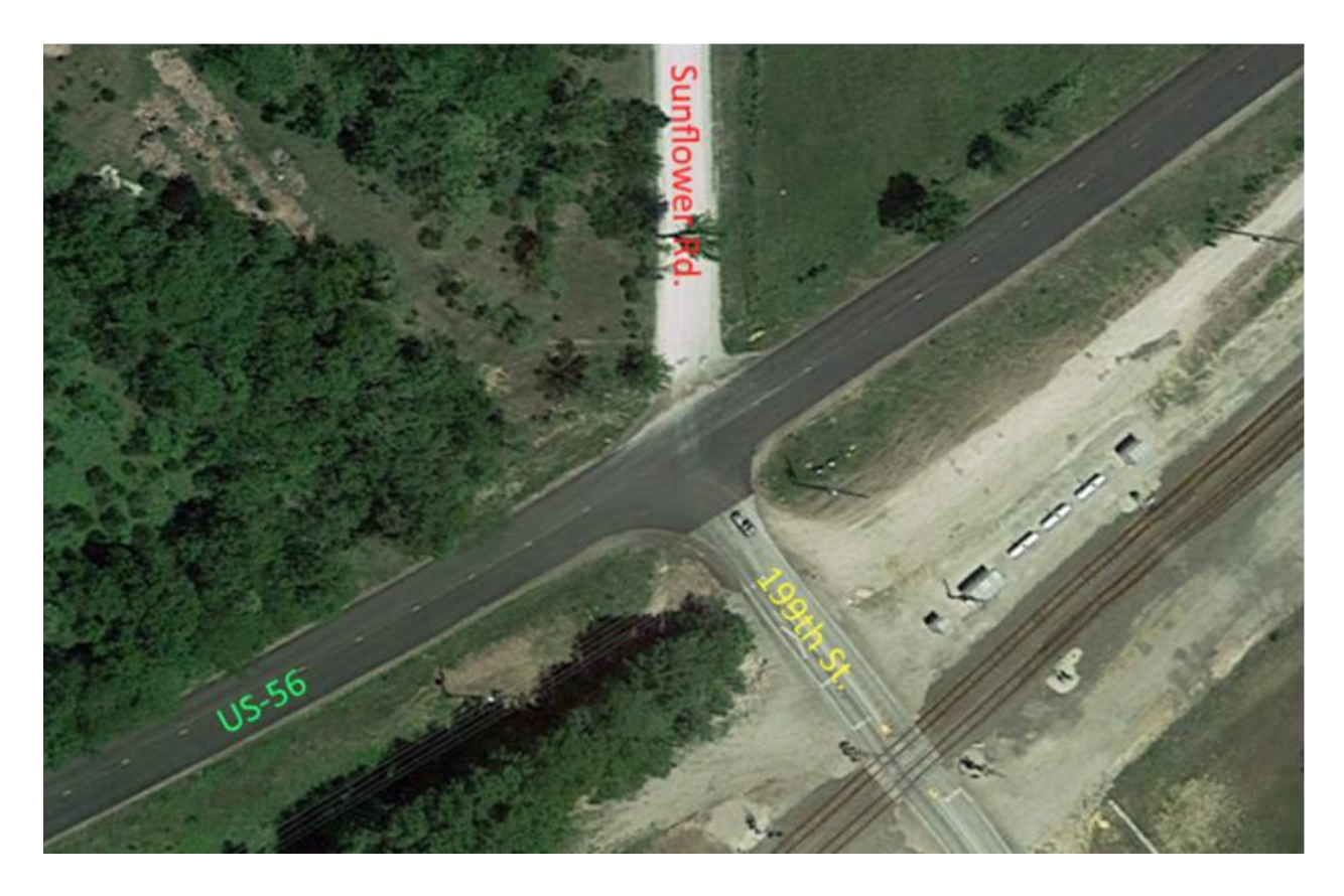
Existing intersection at U.S. 56 & 199<sup>th</sup> St.