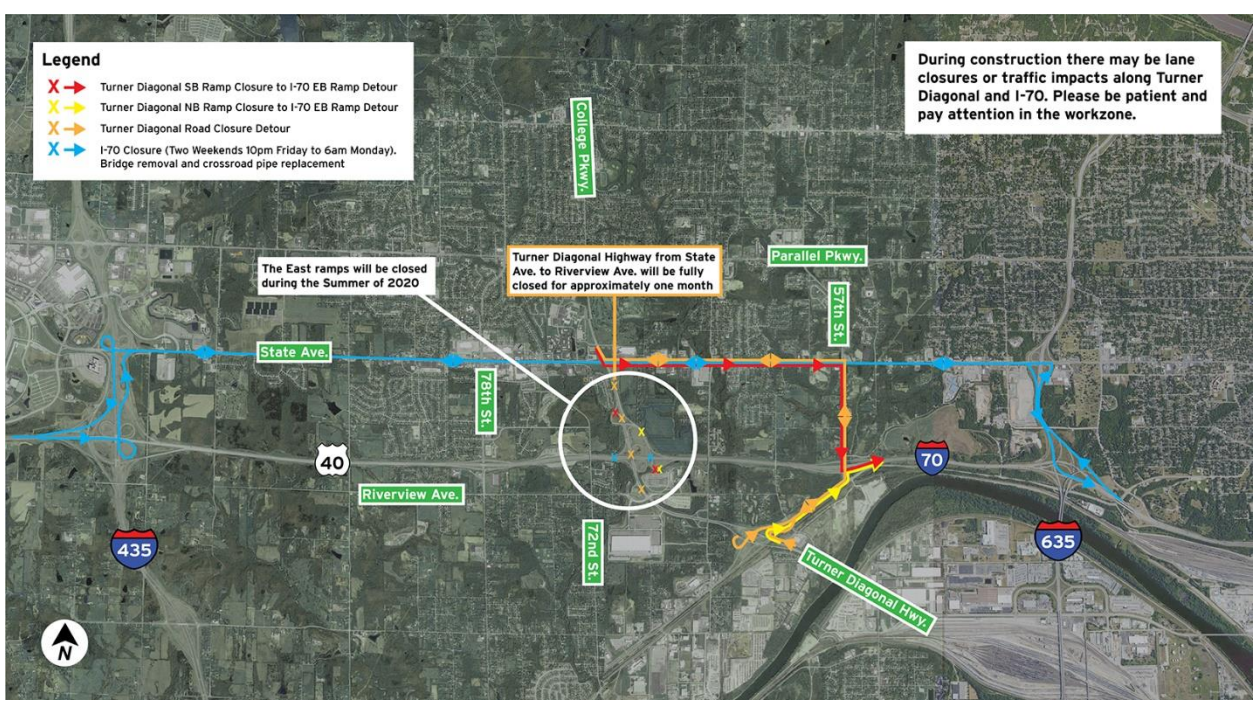
East ramp detour map