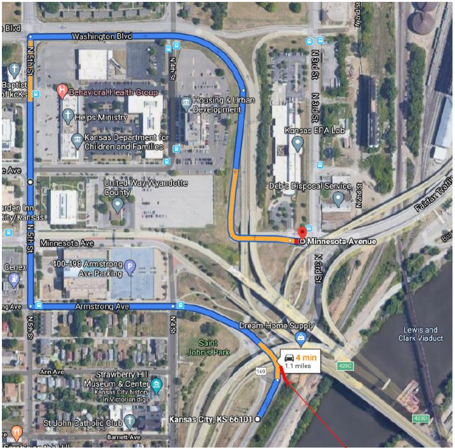
Detour route for bridge utility work on Lewis & Clark Viaduct, Wed. Aug. 12